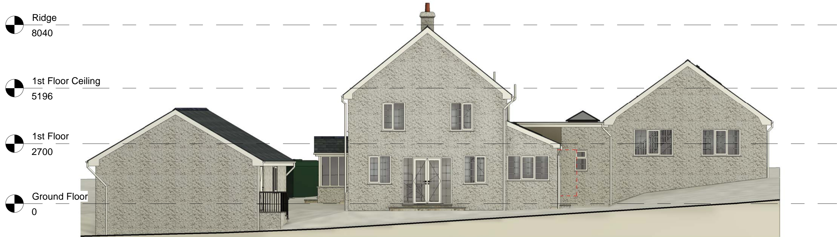
Proposed Side (E) Elevation