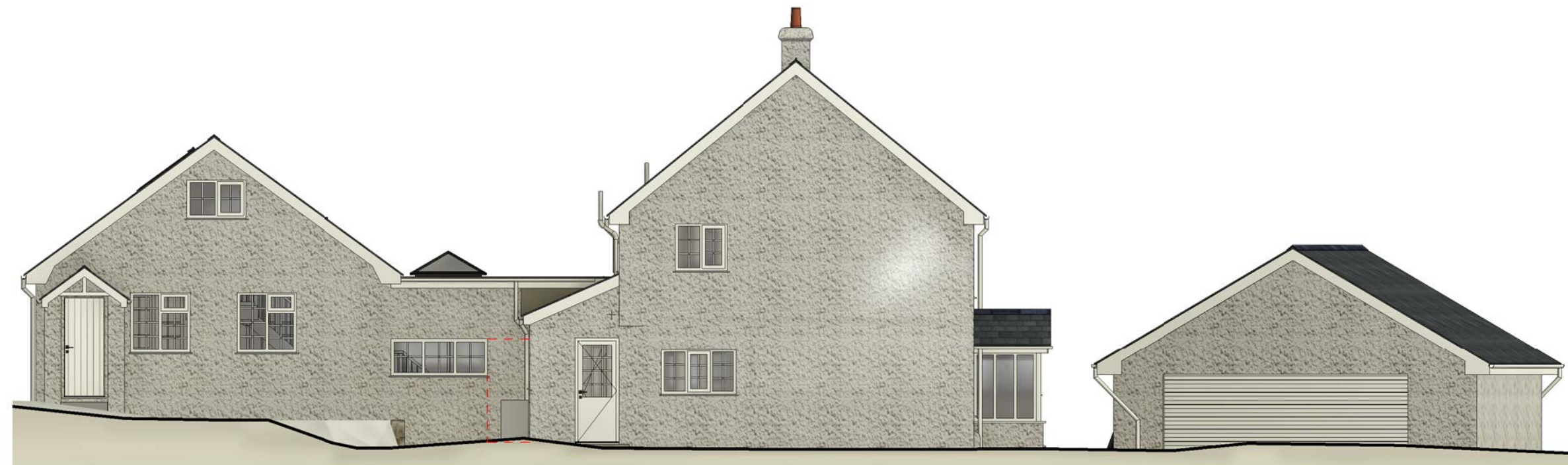
Proposed Side (W) Elevation