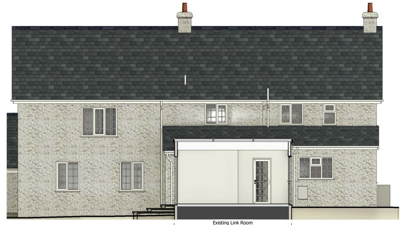
Existing Rear Main House 1 : 100