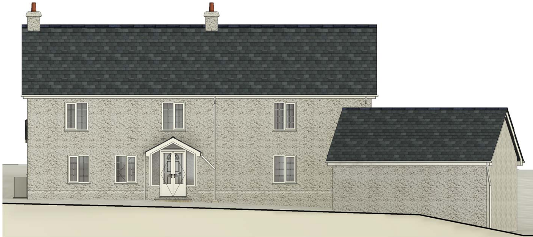
Existing Front with Garage 1 : 100

These drawings are Copyright of PWS-Plans (Party Wall Surveying Limited). Surveys of existing are based on non-intrusive measurements being taken and assumption have been made to the construction of the existing. Existing wall sizes etc. are shown but do not detail the makeup which must be checked on site at commencement of the project. All sizes must be checked on site for construction and manufacturing purposes and all agreed with Building Control if relevant. These drawings must be read in conjunction with the Building Regulations (B.R.) Notes where attached.