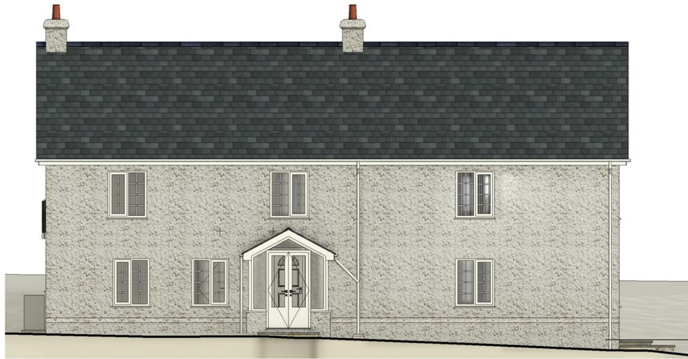
Existing Front (S) Elevation 1 : 100