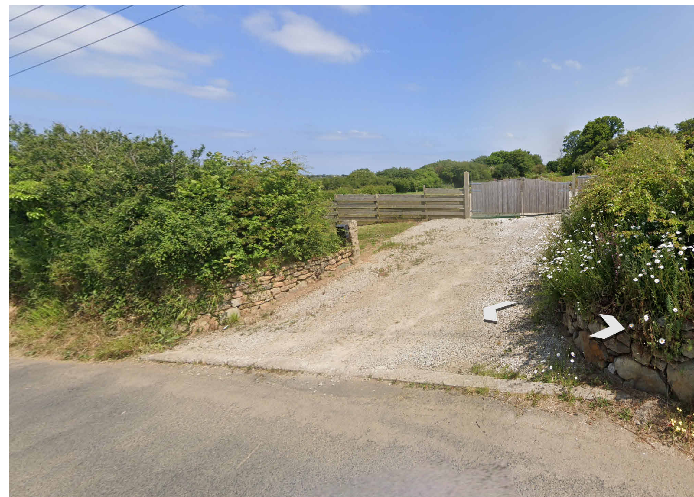
Site Boundary To Use Existing Access To Carriage Way