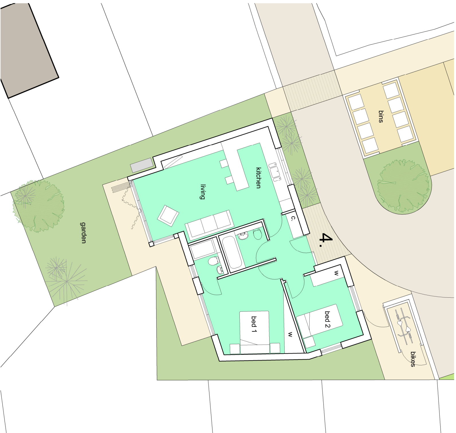
Proposed floor plan - Unit 4 Scale 1:100 @A3