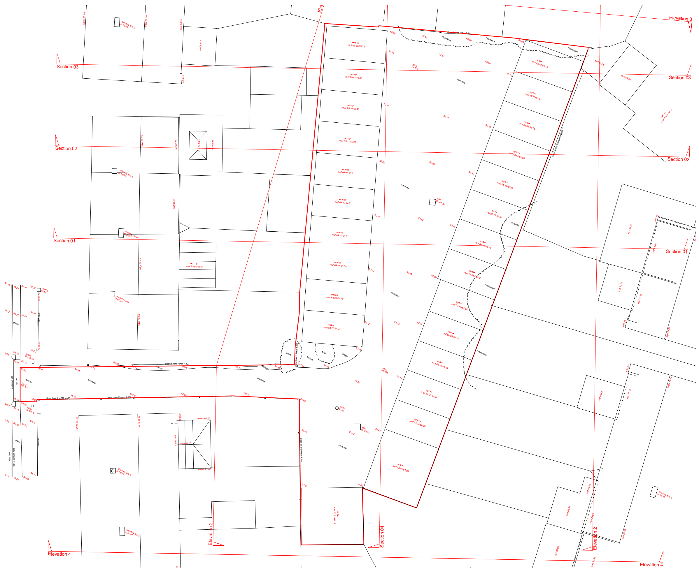
01 EXISTING Roof Plan 1:200

Structural information is for illustrative purposes please refer to structural engineer drawings for comprehensive structural strategy.