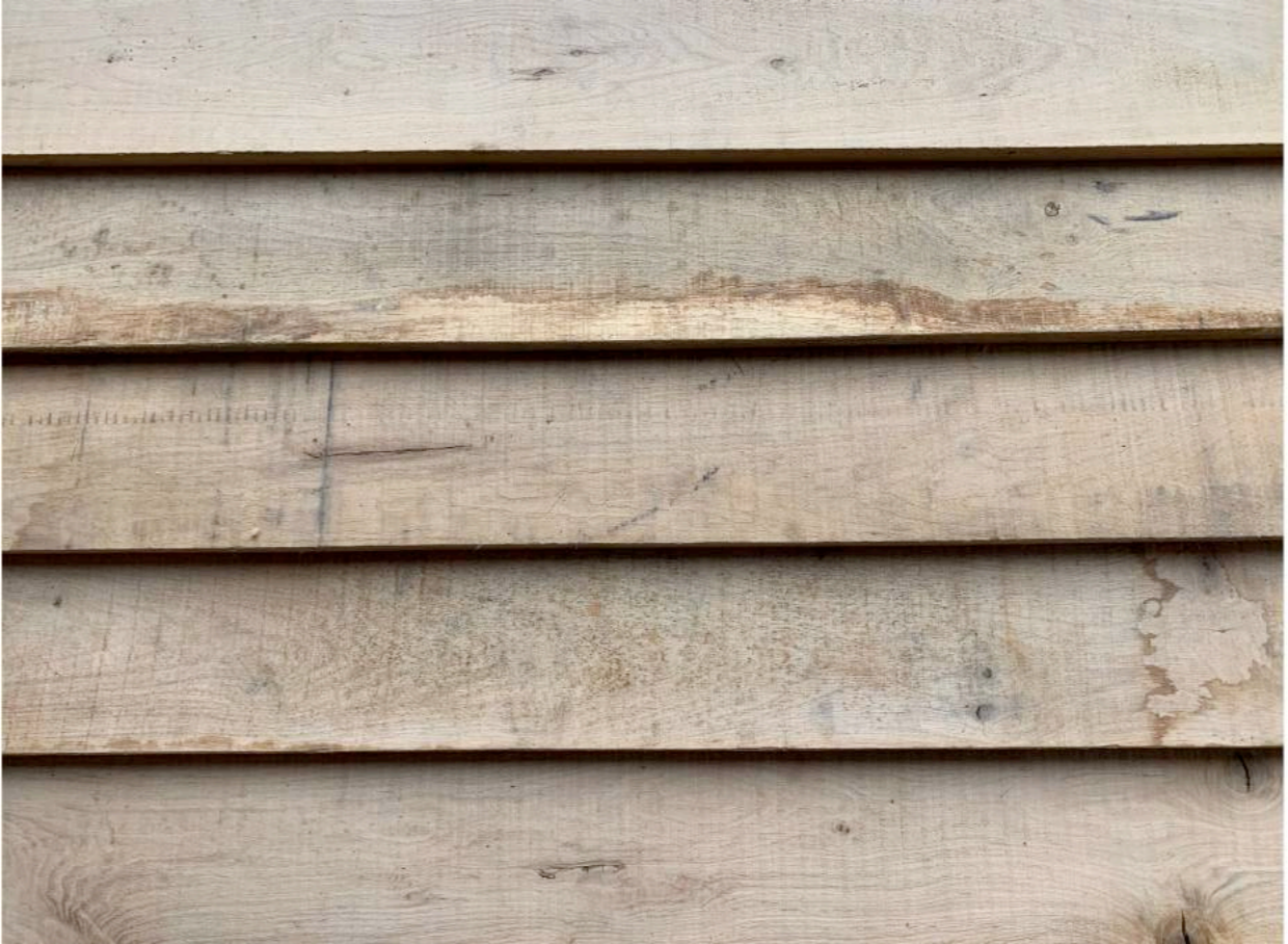
PROPOSED TIMBER CLADDING