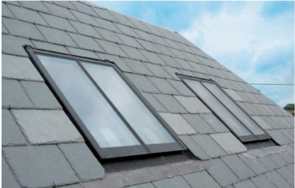
PROPOSED CONSERVATION TYPE ROOF LIGHT