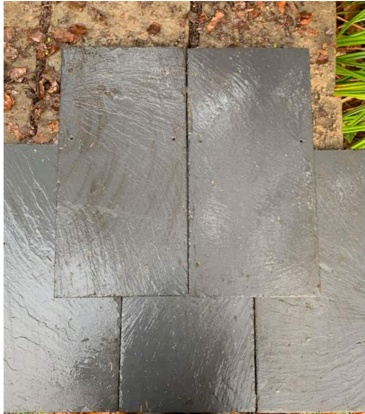
PROPOSED ROOF TILES