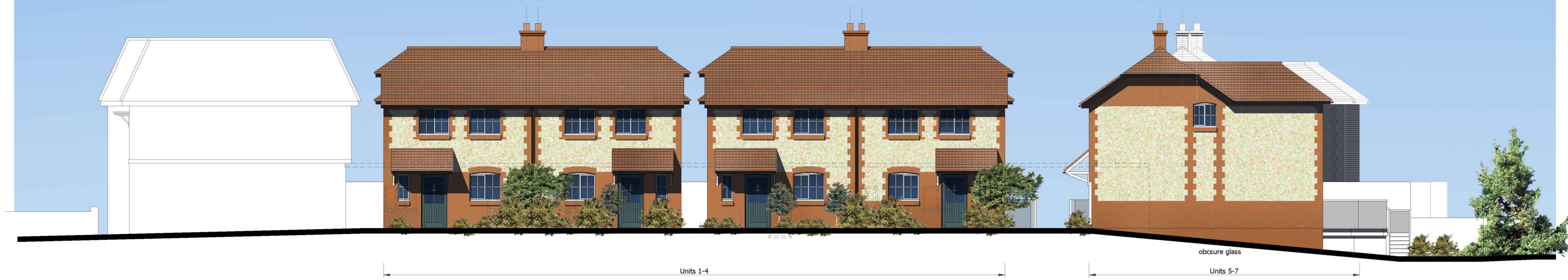
South-West Elevation - materials - roof - plain tiles / walls - face brick and stonework / door + windows - painted timber / rw goods - pvc-u