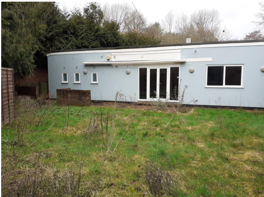
Image 02 – Amenity grassland, cypress treeline and single-storey section of the building found within the southern section of the site.