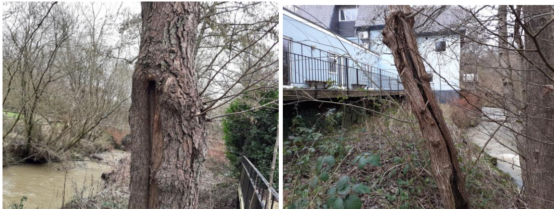
Image 06 – Tree T01 (left) and T02 (right), both of which contain potential bat roosting features.