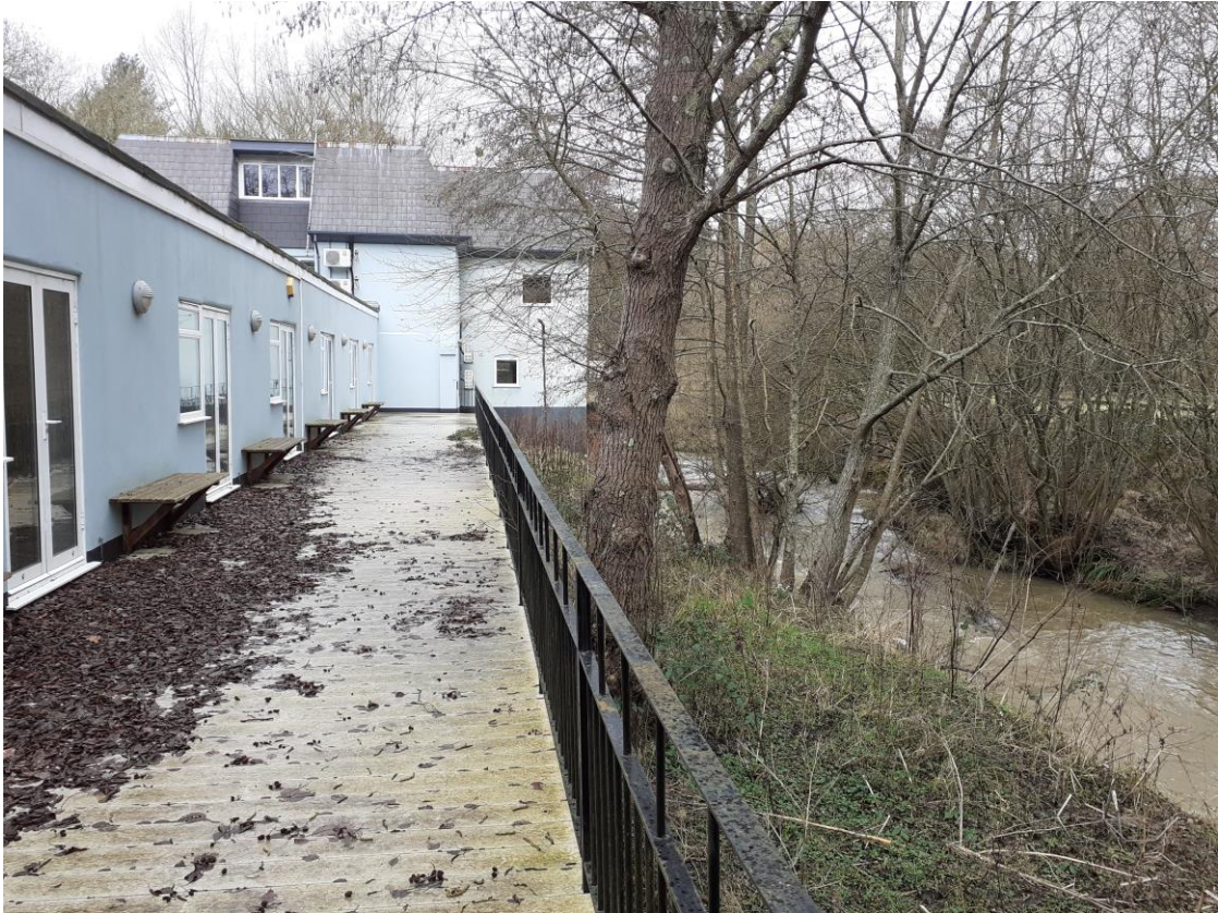
Image 03 – View along the eastern site boundary, showing tall ruderal, scattered trees and river corridor.