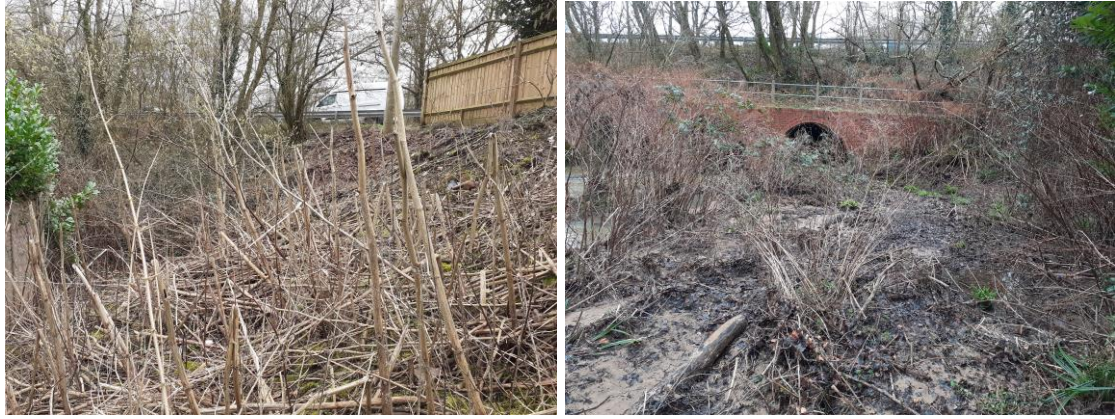
Image 07 – Areas of suspected Japanese knotweed identified on site.