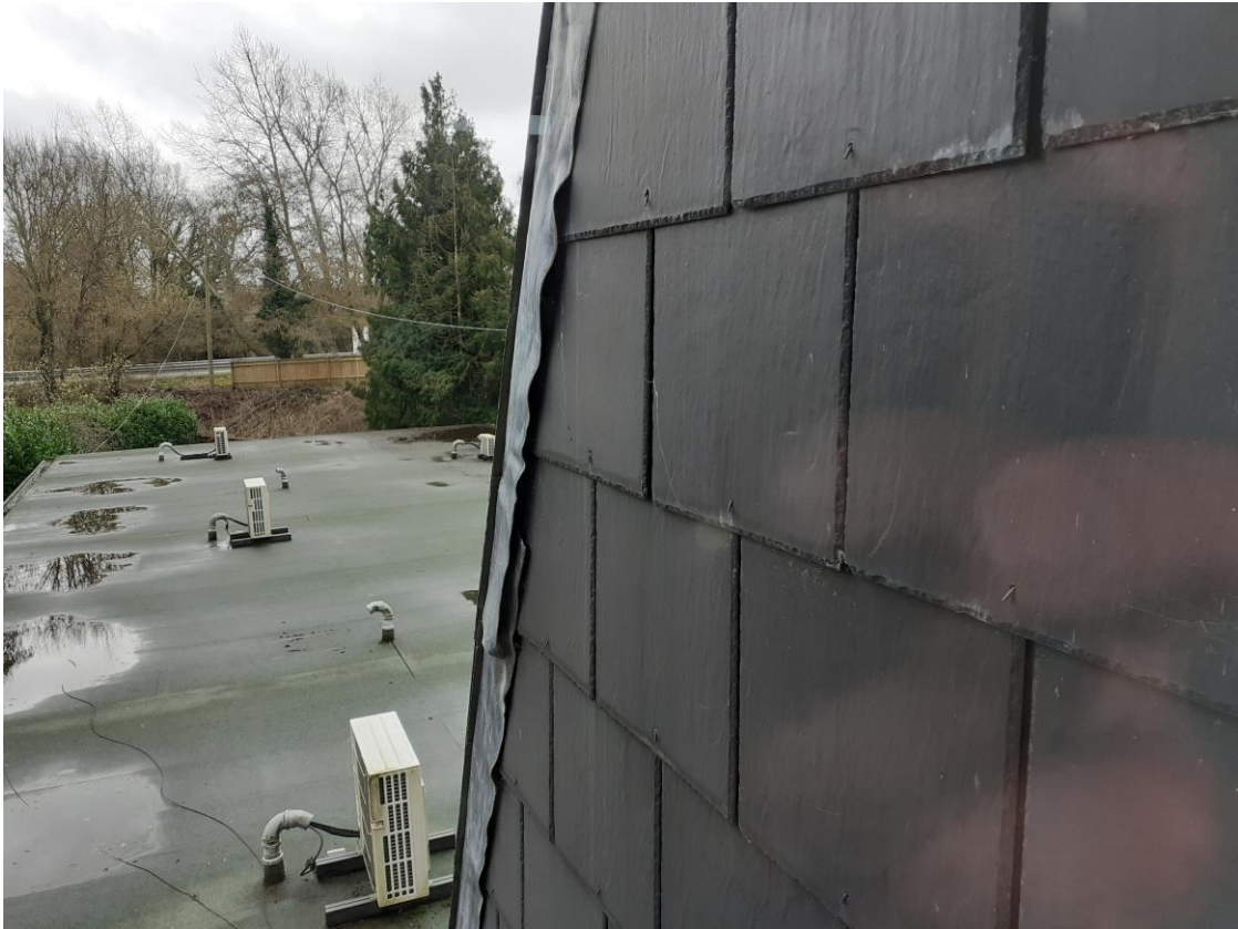
Image 05 – Example of raised flashing which could provide roosting space for crevice dwelling species of bat.