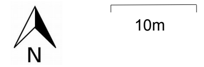
Figure No. 01 – Site Habitat Plan Watermill, Halfway Bridge