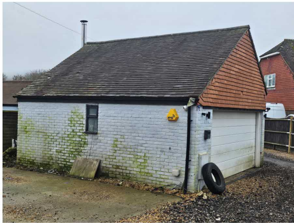
Photo of existing double garage with tight access shown to the right.

The front area of the site known as Savi Maski Granza is used by Findon Trade Cars, there is currently a detached double garage with pitched roof and independent office building on the site, however these buildings are not ideally positioned and create a very tight access into the remaining areas of the storage/ industrial facility.