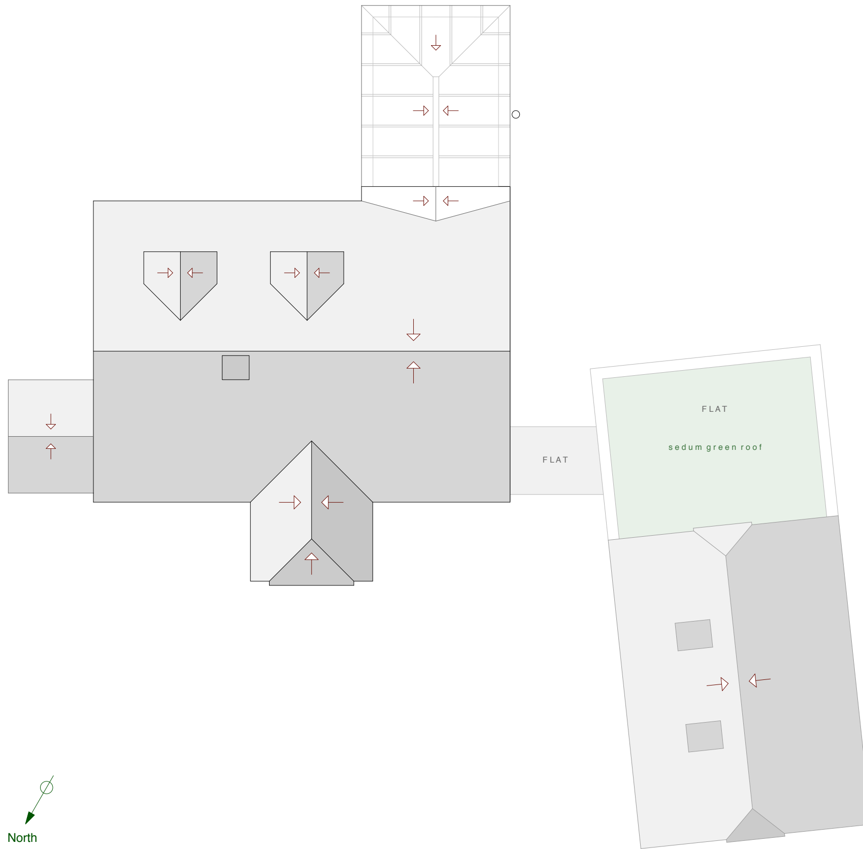
Proposed Roof Plan at 1:100 scale

DRAWINGS & SCALE BAR ARE FOR PLANNING PURPOSES ONLY. THESE ARE NOT SURVEY DRAWINGS