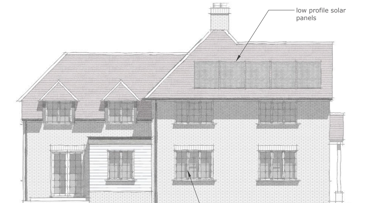
South Elev Scale 1:100 @ A3

New & Replacement windows specification: Rational Forma OR Rational Forma Plus OR similar