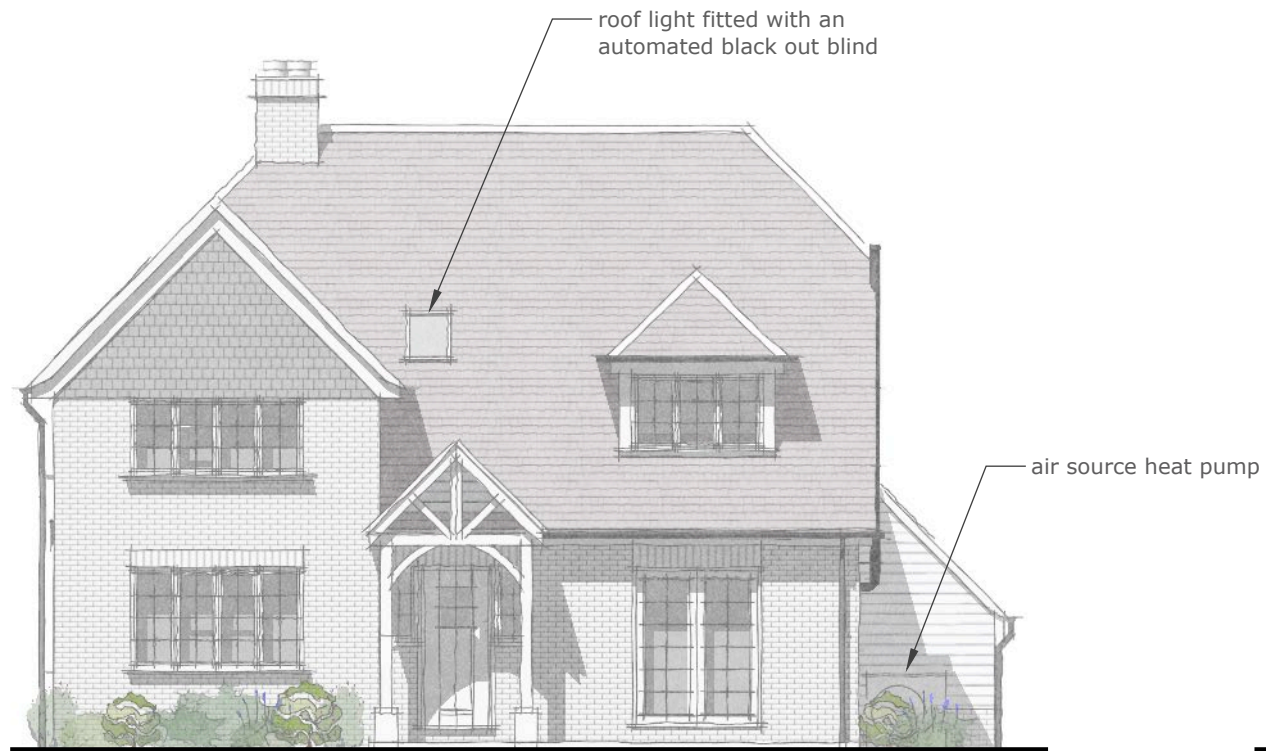
East Elev Scale 1:100 @ A3