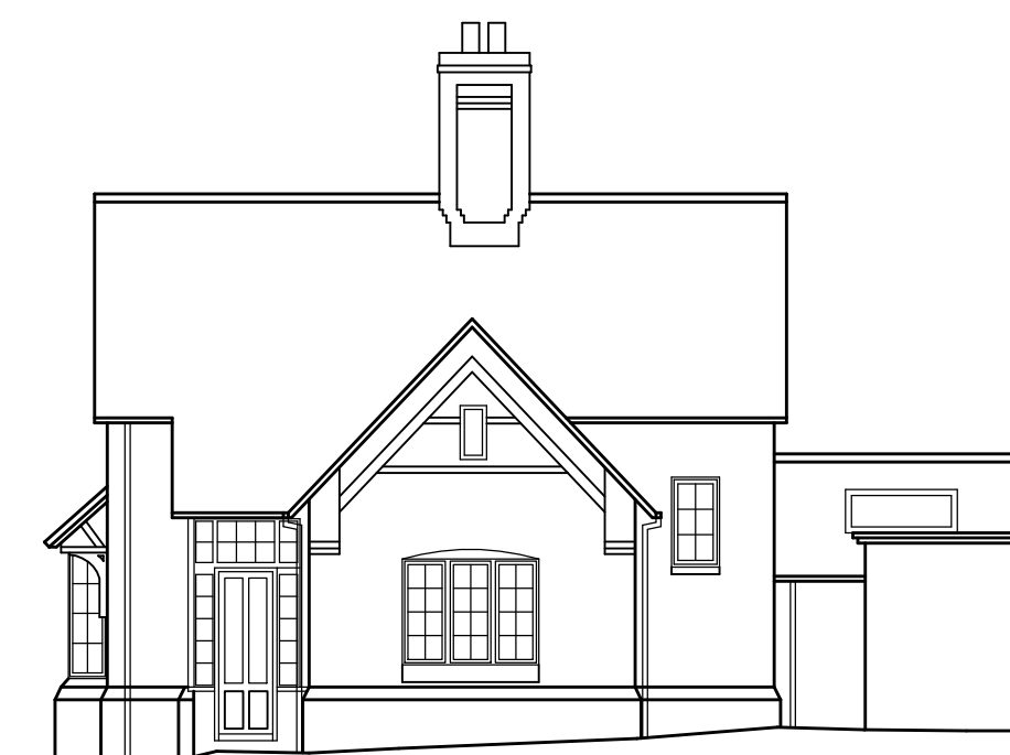
110.0m DATUM SOUTH ELEVATION