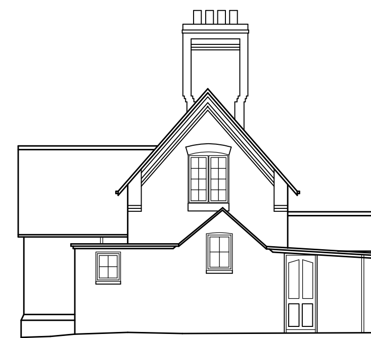
110.0m DATUM EAST ELEVATION