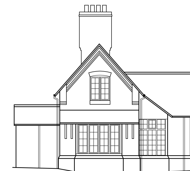
110.0m DATUM WEST ELEVATION

NOTES: LEVELS RELATE TO DS DATUM TREE SPECIES SHOULD BE VERIFIED WHERE OF CRITICAL IMPORTANCE THE ARCHITECT SHOULD SATISFY HIMSELF THAT ALL TREES LIKELY TO AFFECT HIS DESIGN HAVE BEEN SHOWN INTER CONNECTION OF MANHOLES SHOULD BE VERIFIED WHERE OF CRITICAL IMPORTANCE USING CCTV PIPE SIZES & INVERTS DETERMINED WITHOUT ENTRY INTO MANHOLE ALL DIMENSIONS & LEVELS SHOWN IN METRES ON SITE DIMENSION ACCURACY IS TAKEN RELATIVE TO THE PRINTED SCALE AND SHOULD BE CHECKED ON SITE WHERE OF CRITICAL IMPORTANCE