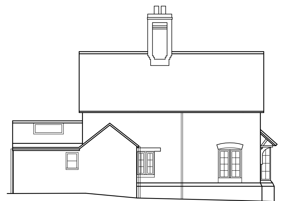
110.0m DATUM NORTH ELEVATION