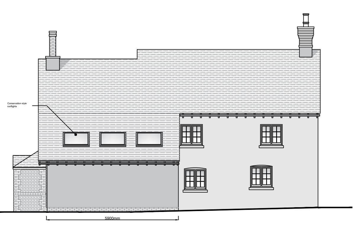
Proposed Rear Elevation (Scale 1:100)