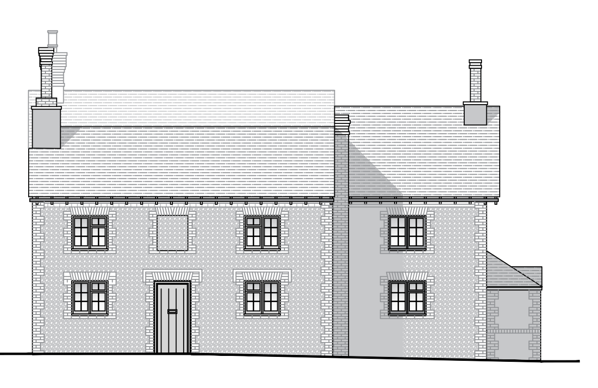
Proposed Front Elevation (Scale 1:100)