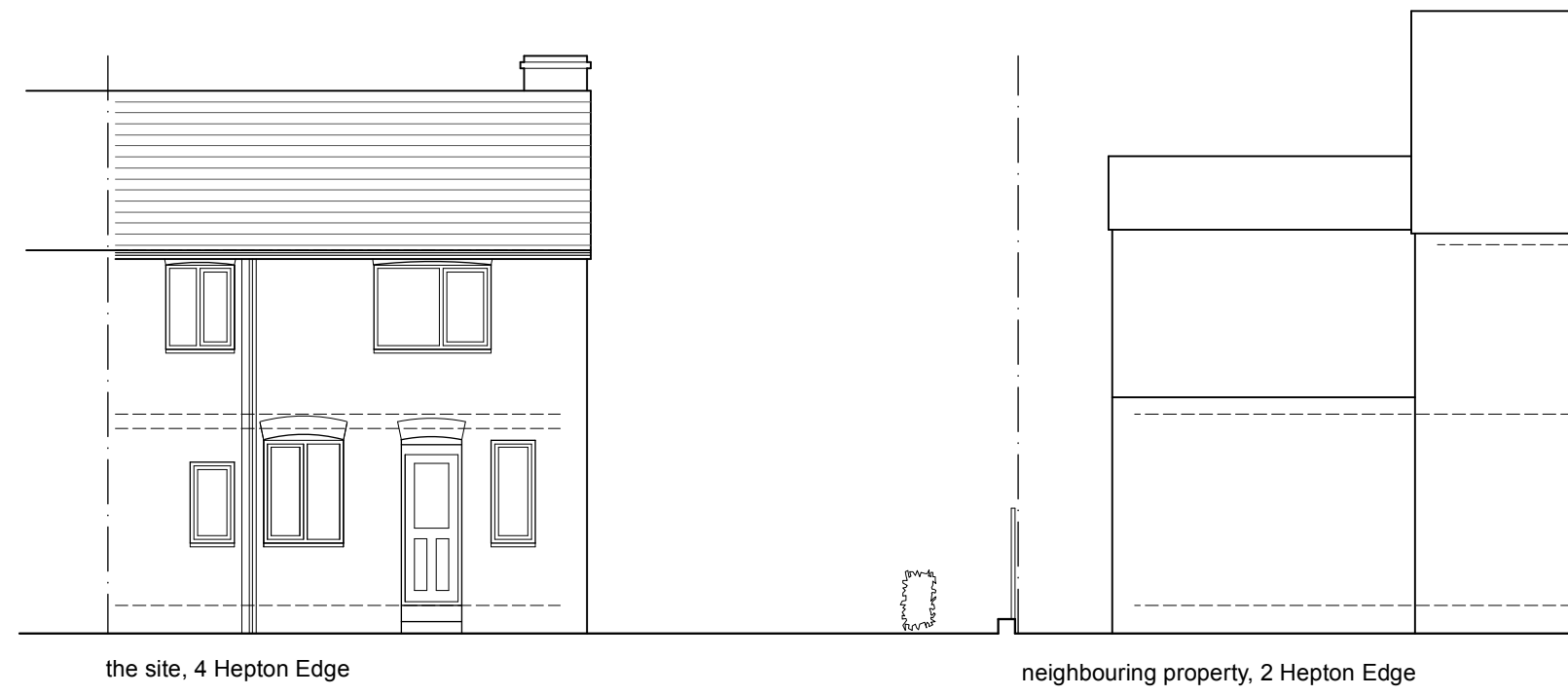
Existing North East Elevation

neighbouring property, 1 and 2 Hepton Edge, elevation opposite shown dotted