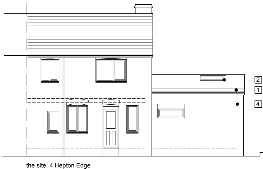
Proposed North East Elevation

neighbouring property, 1 and 2 Hepton Edge, elevation opposite shown dotted