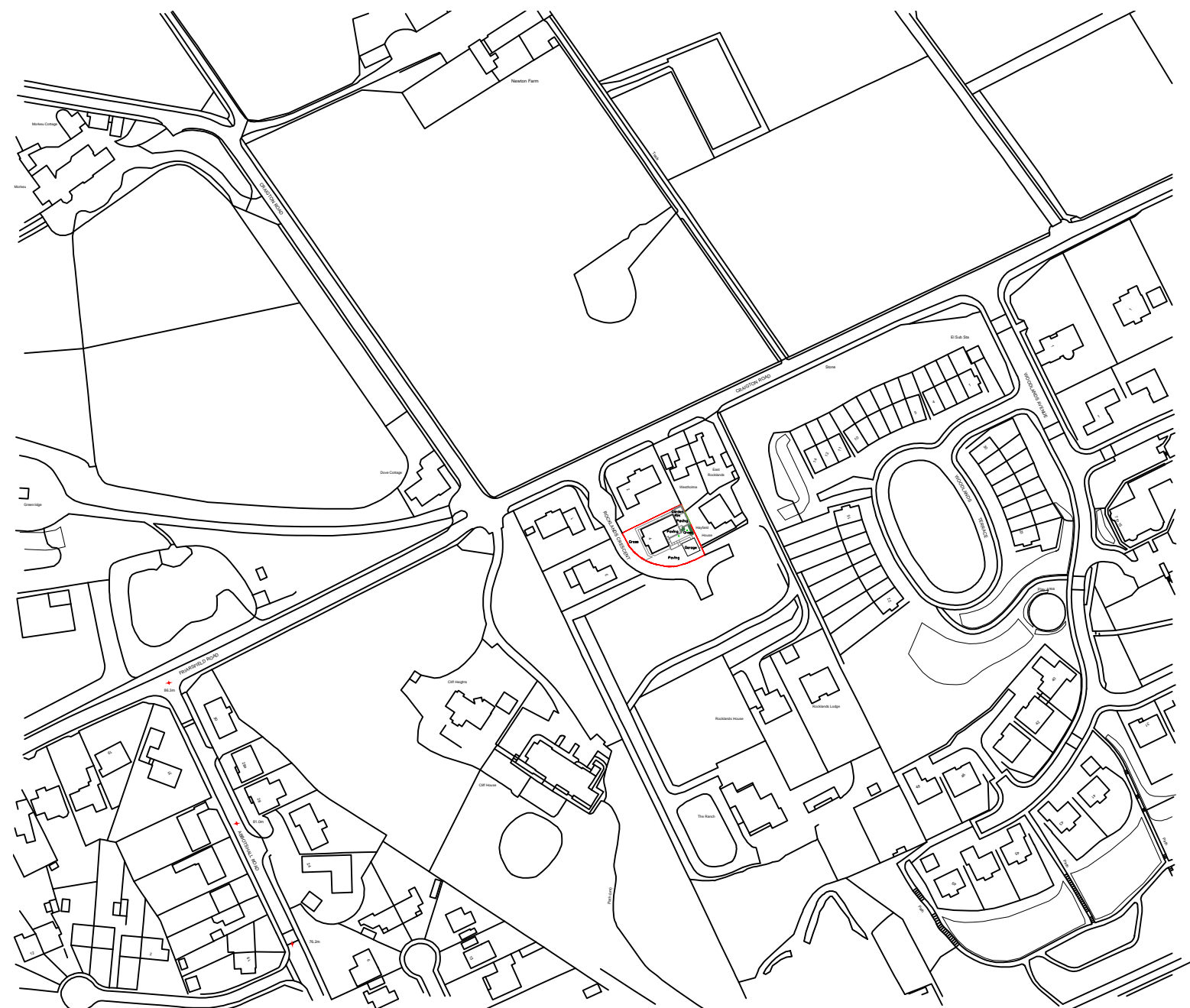
Location Plan Scale 1:2500