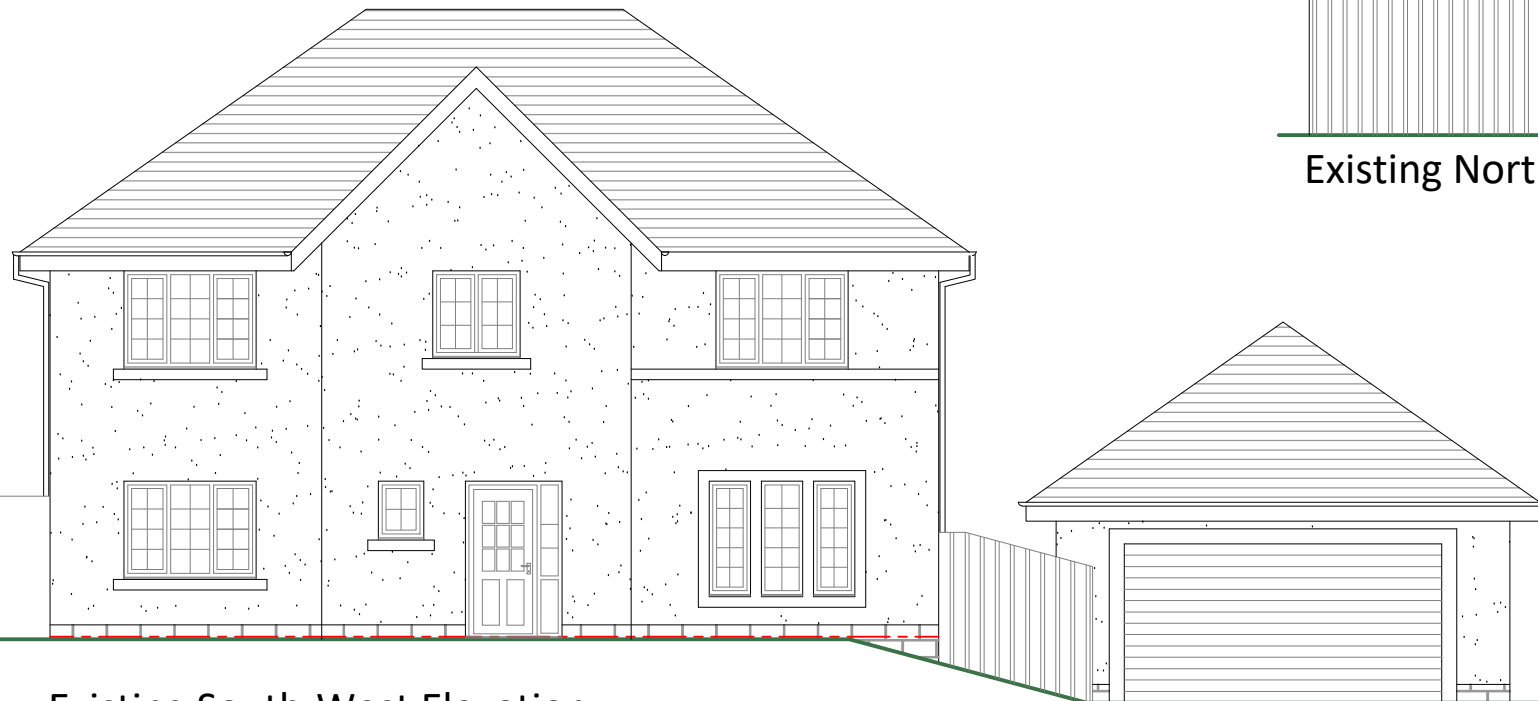
Existing South-West Elevation(1:100)