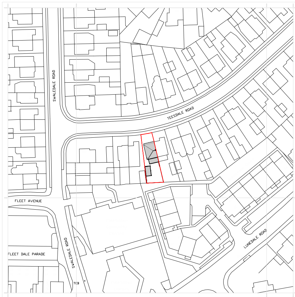
1 PROPOSED SITE LOCATION PLAN 1:1250 @ A4