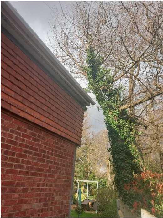
Ref 5: Tree from side of property (2)