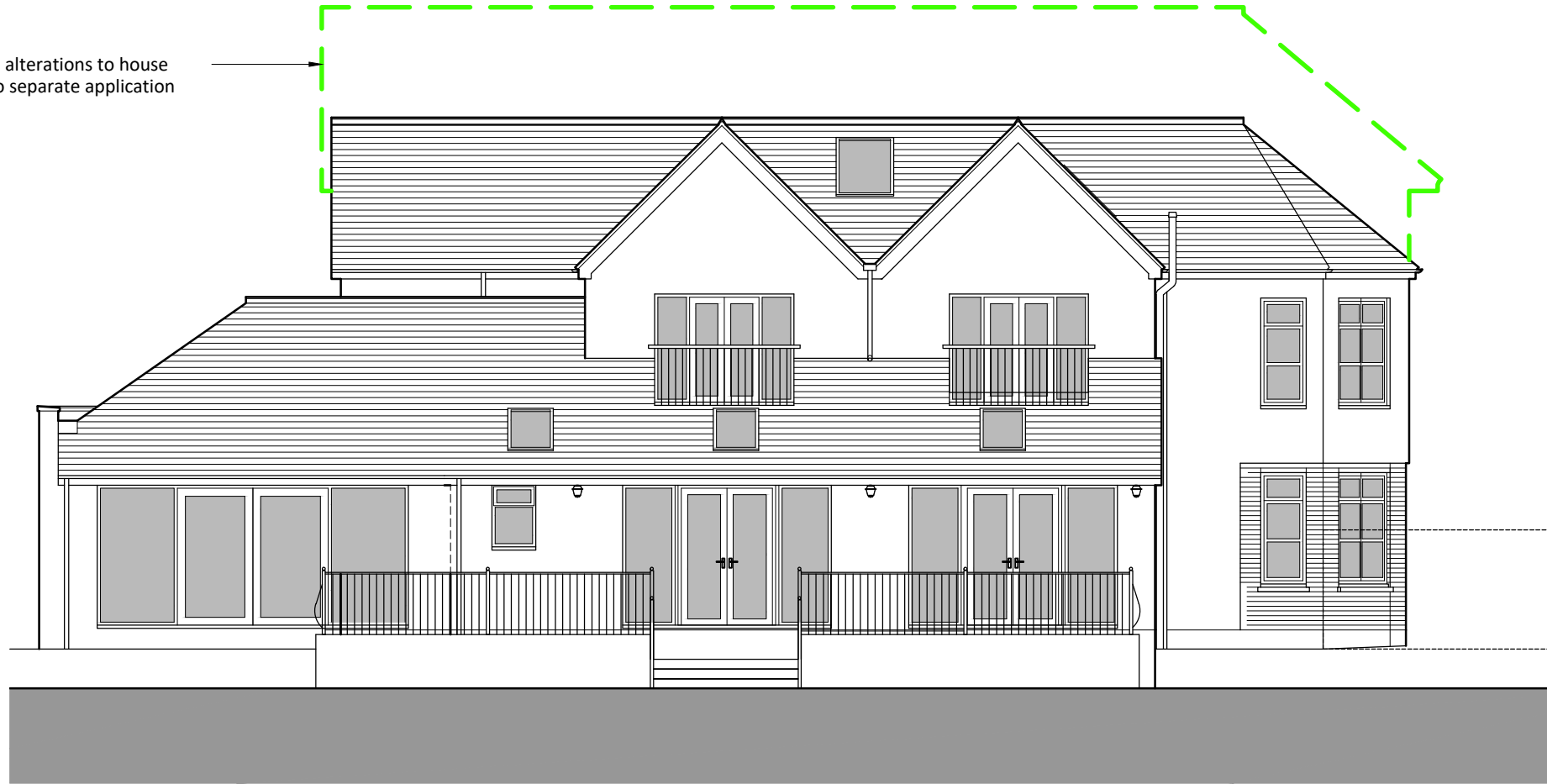
Proposed Rear (North) Elevation 1:100

Proposed alterations to house subject to separate application