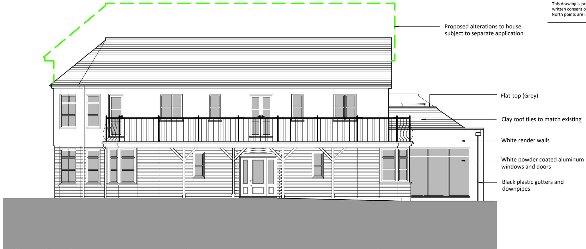
Proposed Front (South) Elevation 1:100