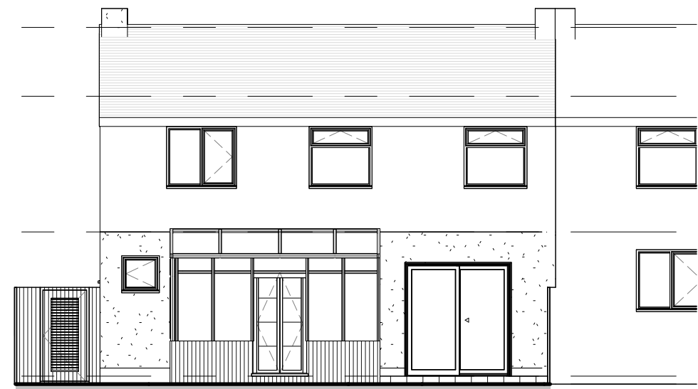
Rear Elevation (South)