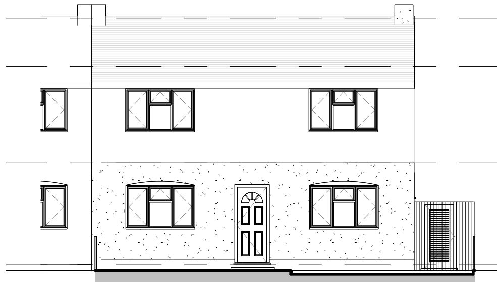
Front Elevation (North)