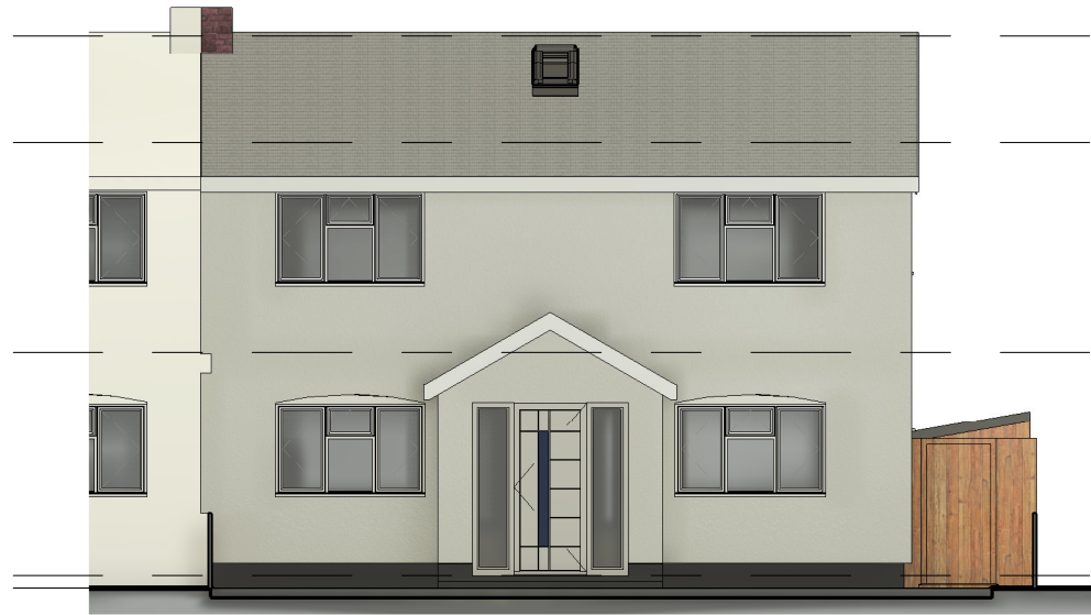
Front Elevation (North)