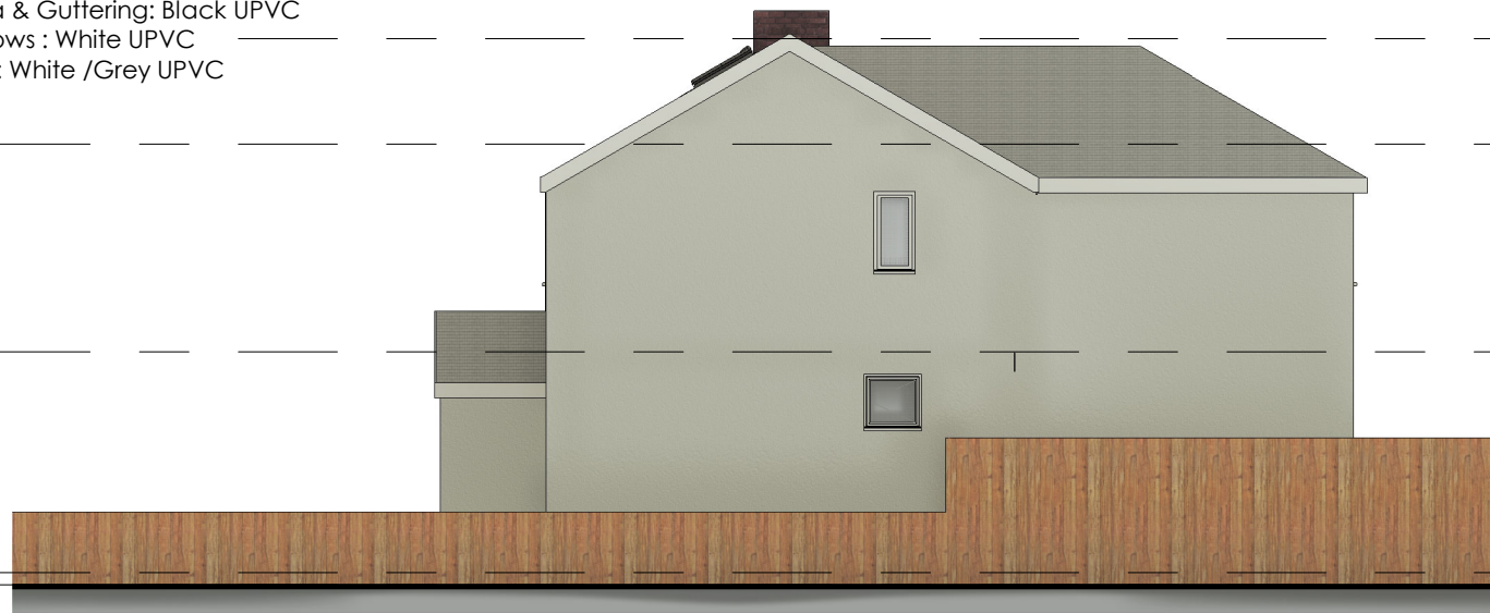
Side Elevation (West)