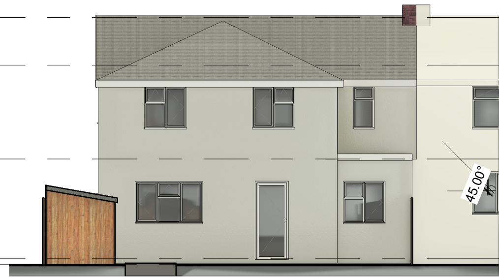
Rear Elevation (South)