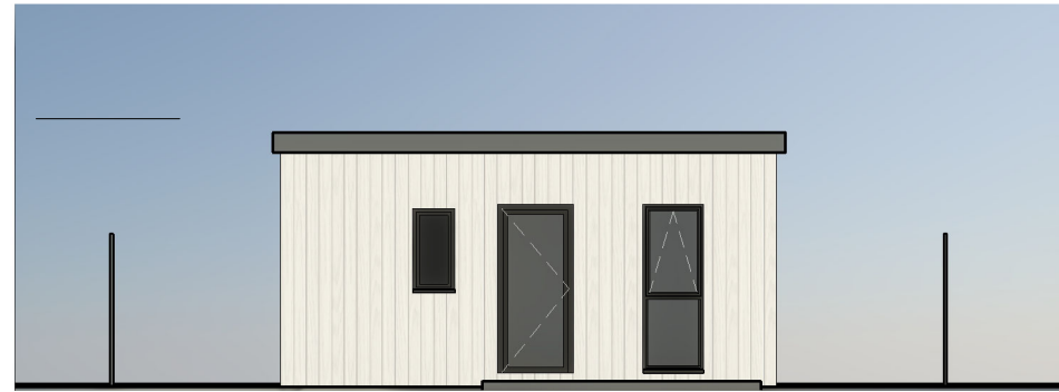
Annex Front Elevation (North)