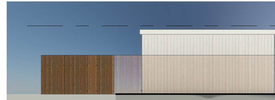
Annex Side Elevation (East)