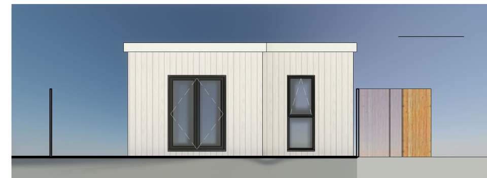
Annex Rear Elevation (South)