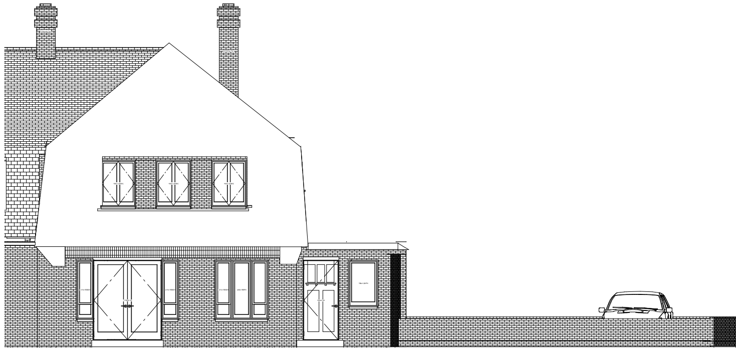
Rear Elevation Scale 1: 100