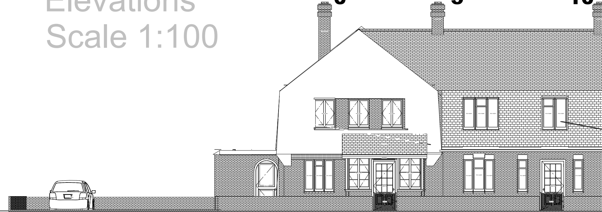
Front Elevation Scale 1: 100