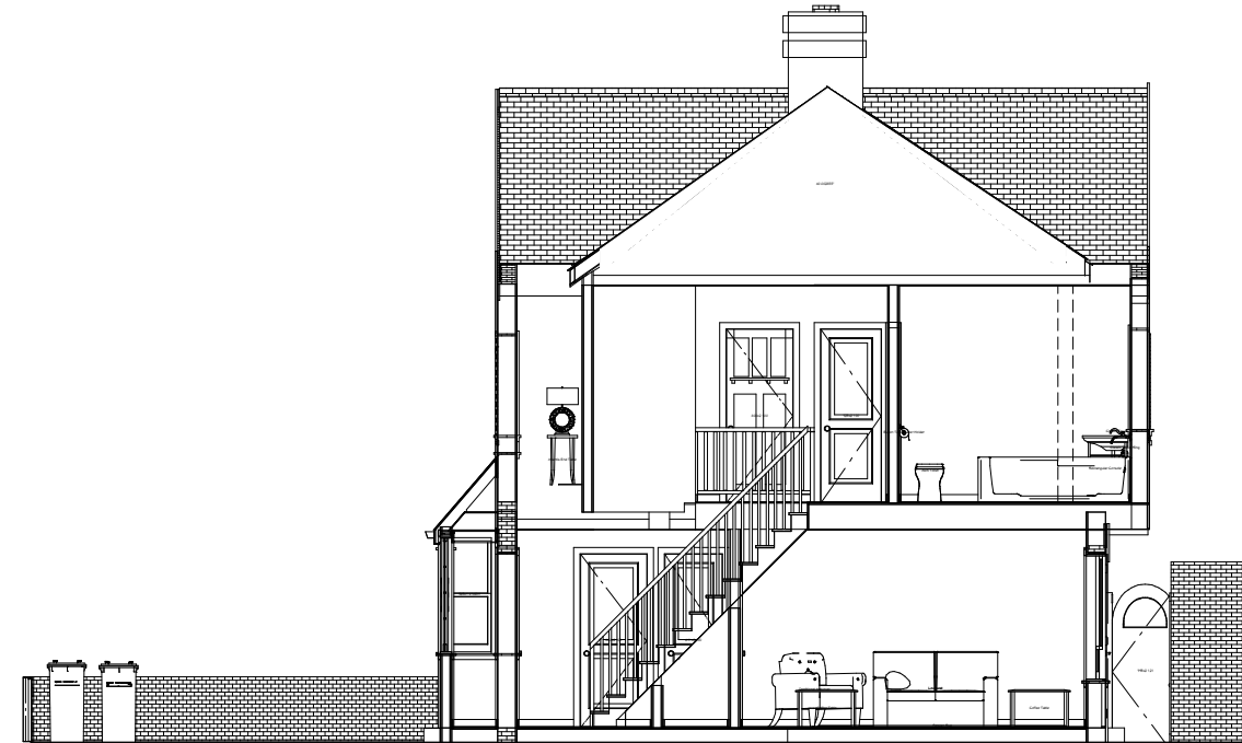
Proposed Section A-A Scale 1: 100