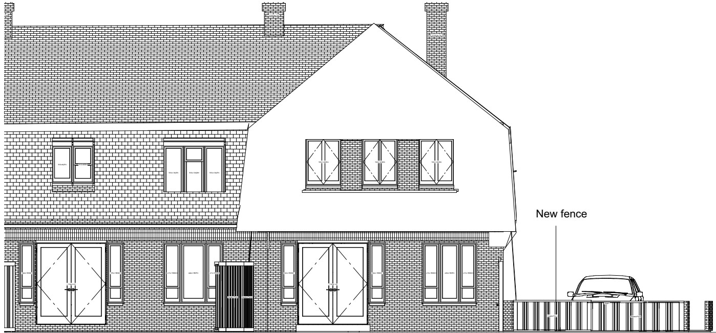
Proposed Rear Elevation Scale 1: 100