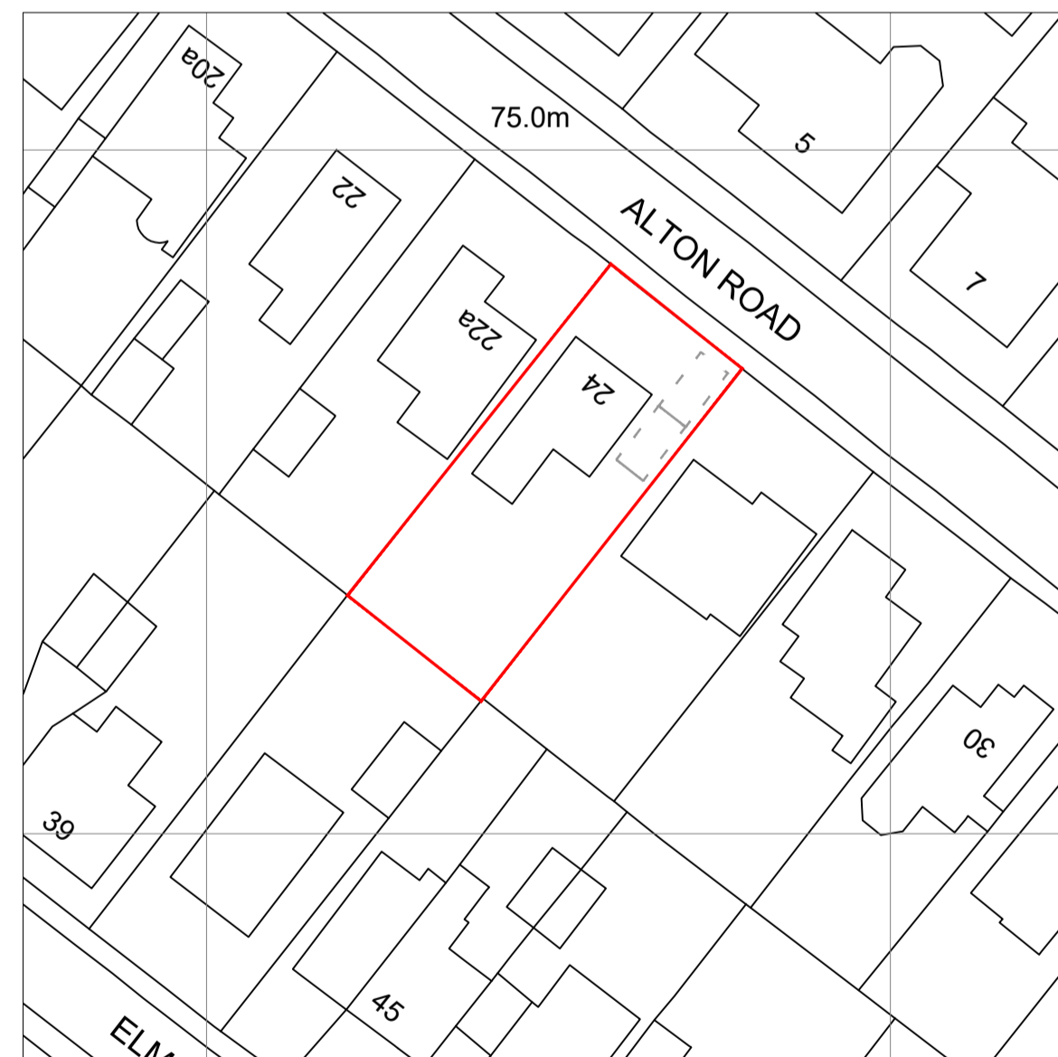
Site Layout Scale 1:500