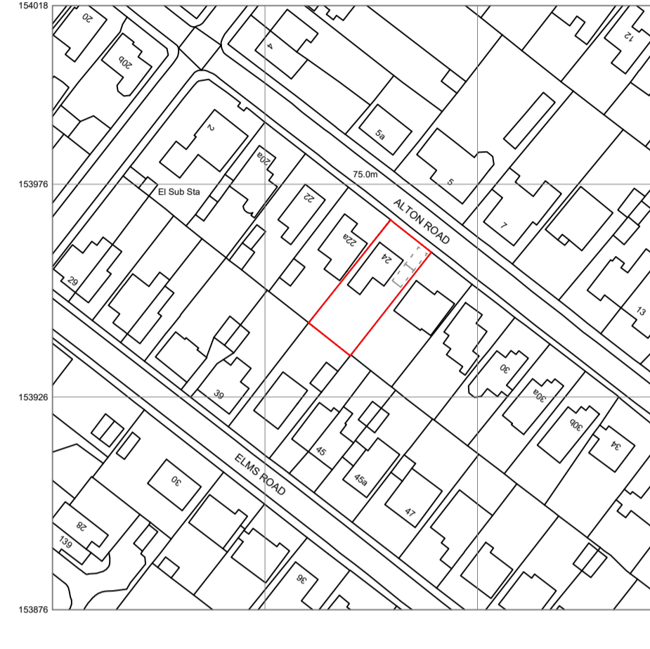
Site Location Scale 1:1250