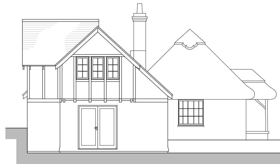
EXISTING SIDE ELEVATION (north-east facing)