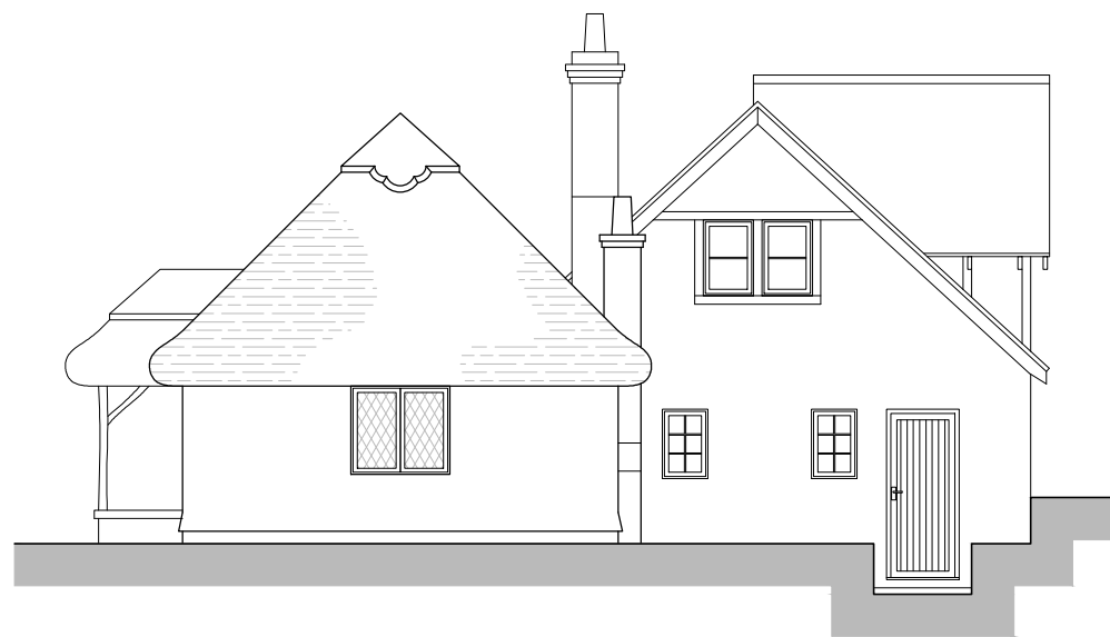
EXISTING SIDE ELEVATION (south-west facing)