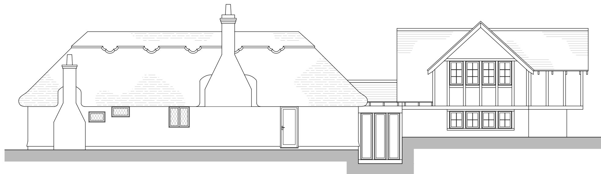
EXISTING REAR ELEVATION (south-east facing)