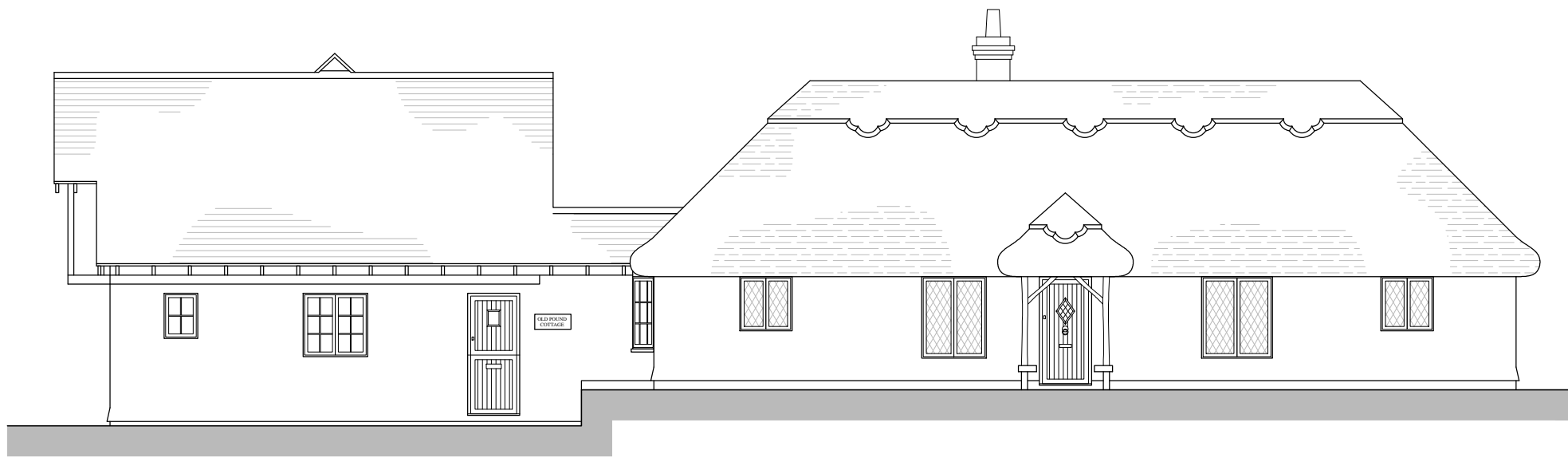
EXISTING FRONT ELEVATION (north-west facing)