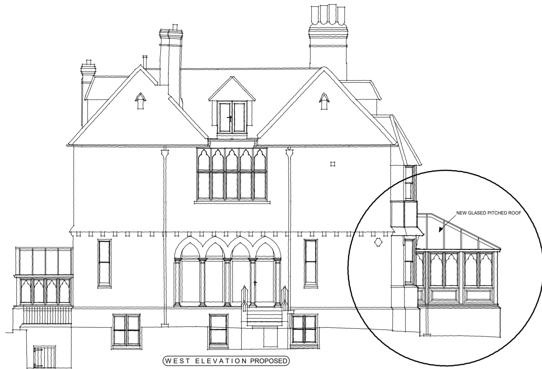
WEST ELEVATION PROPOSED