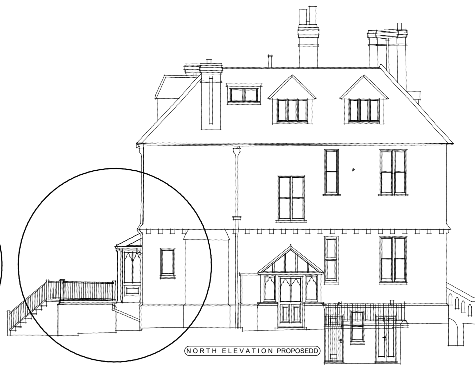
NORTH ELEVATION PROPOSED