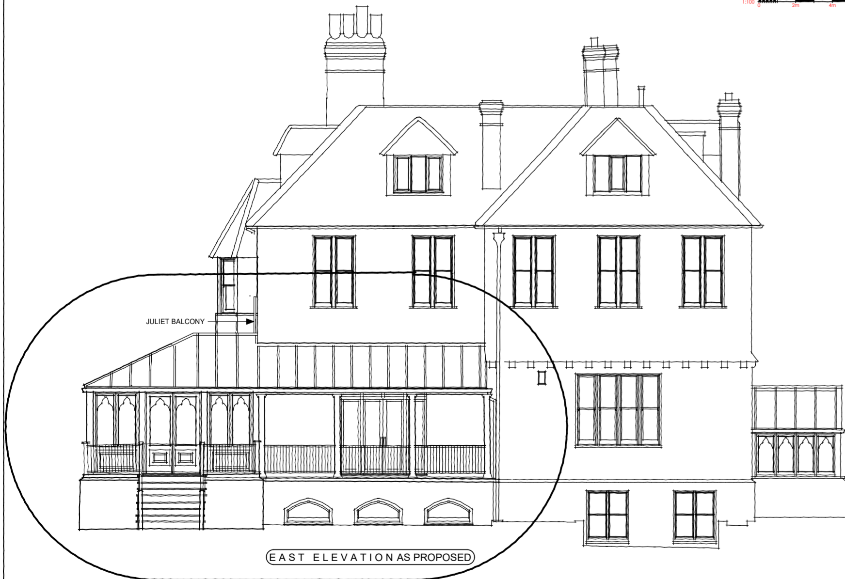
EAST ELEVATION AS PROPOSED