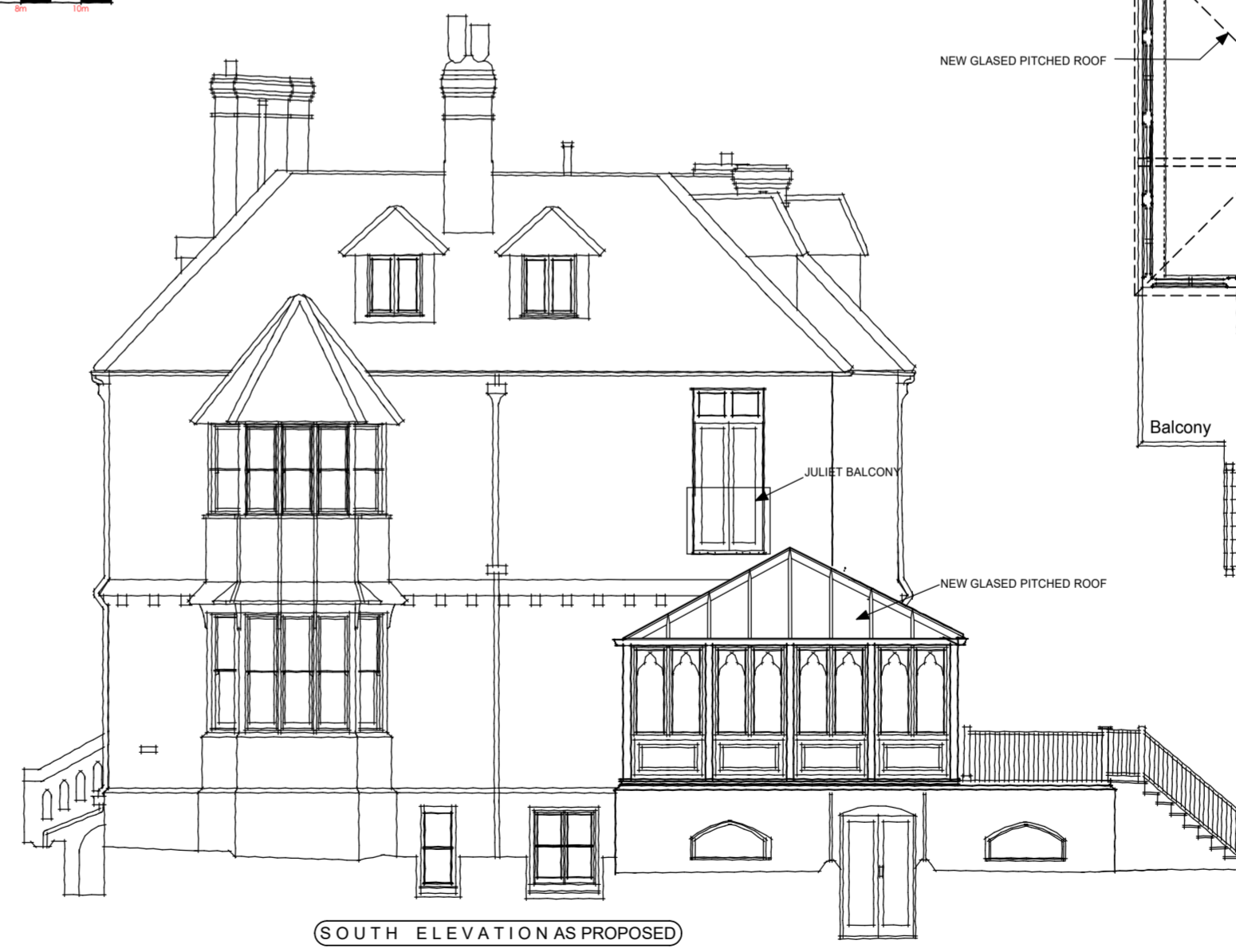
SOUTH ELEVATION AS PROPOSED