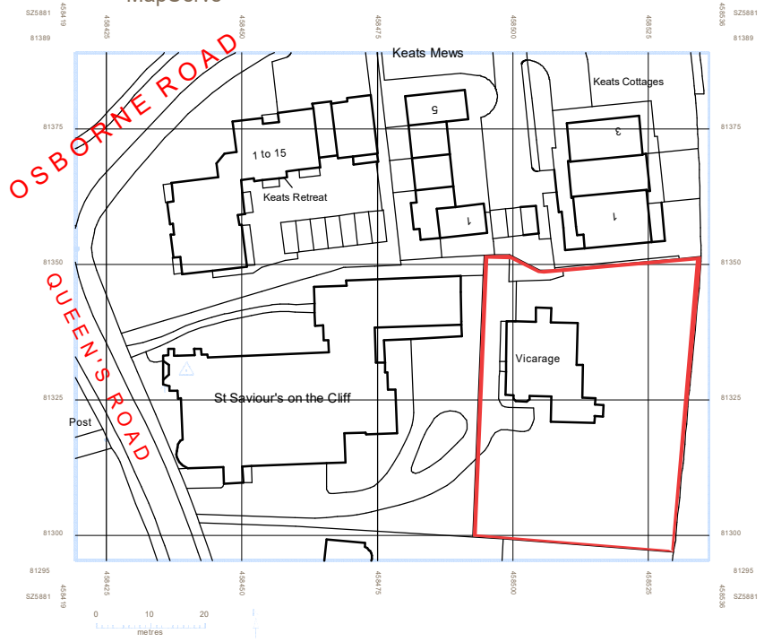
Block plan as proposed 1:500