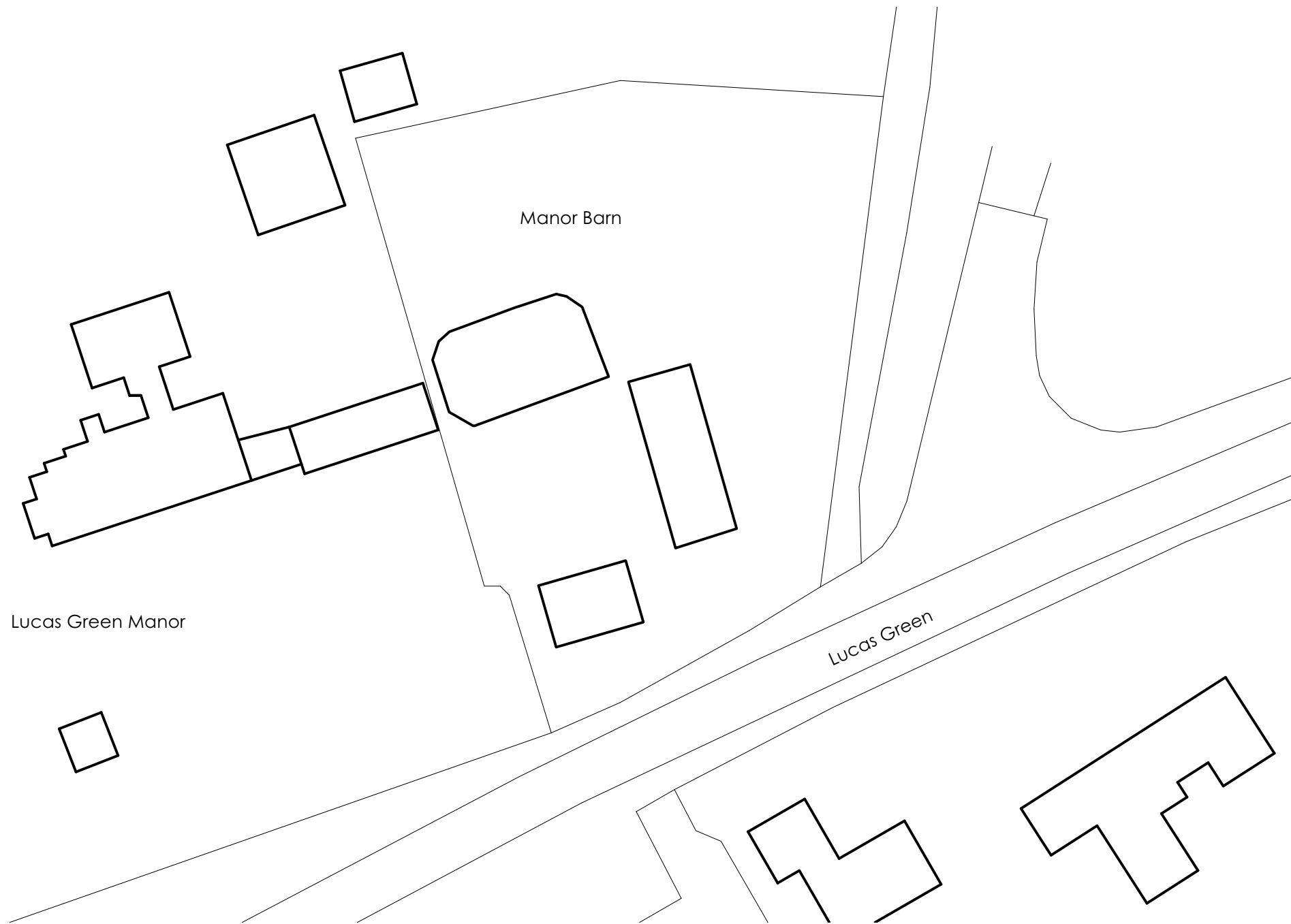
1 Site Plan - existing Scale: 1:500