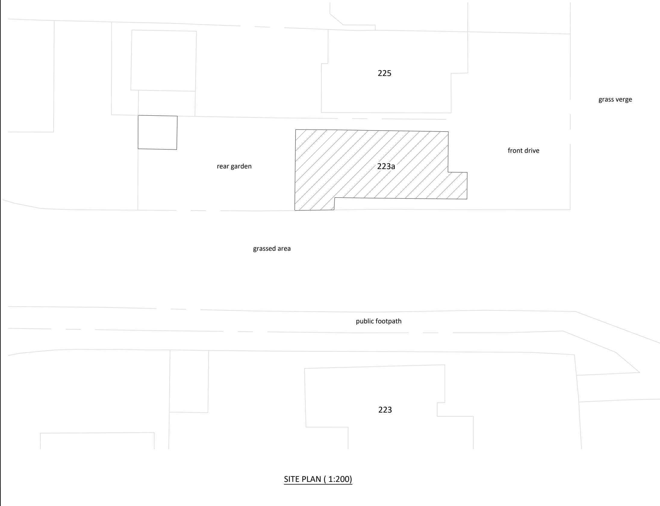
SITE PLAN ( 1:200)