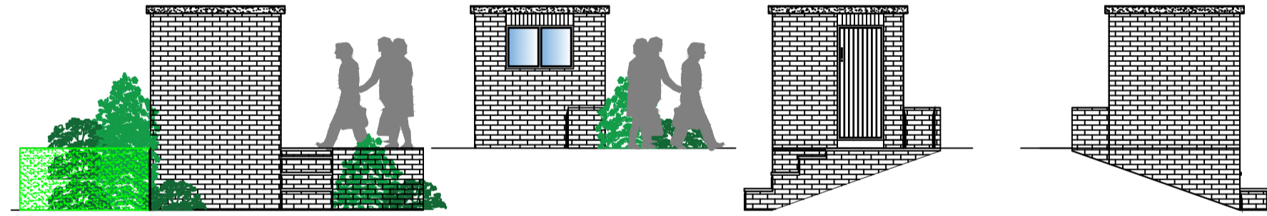
Existing Elevations - Detached garage and garden building - to be demolished