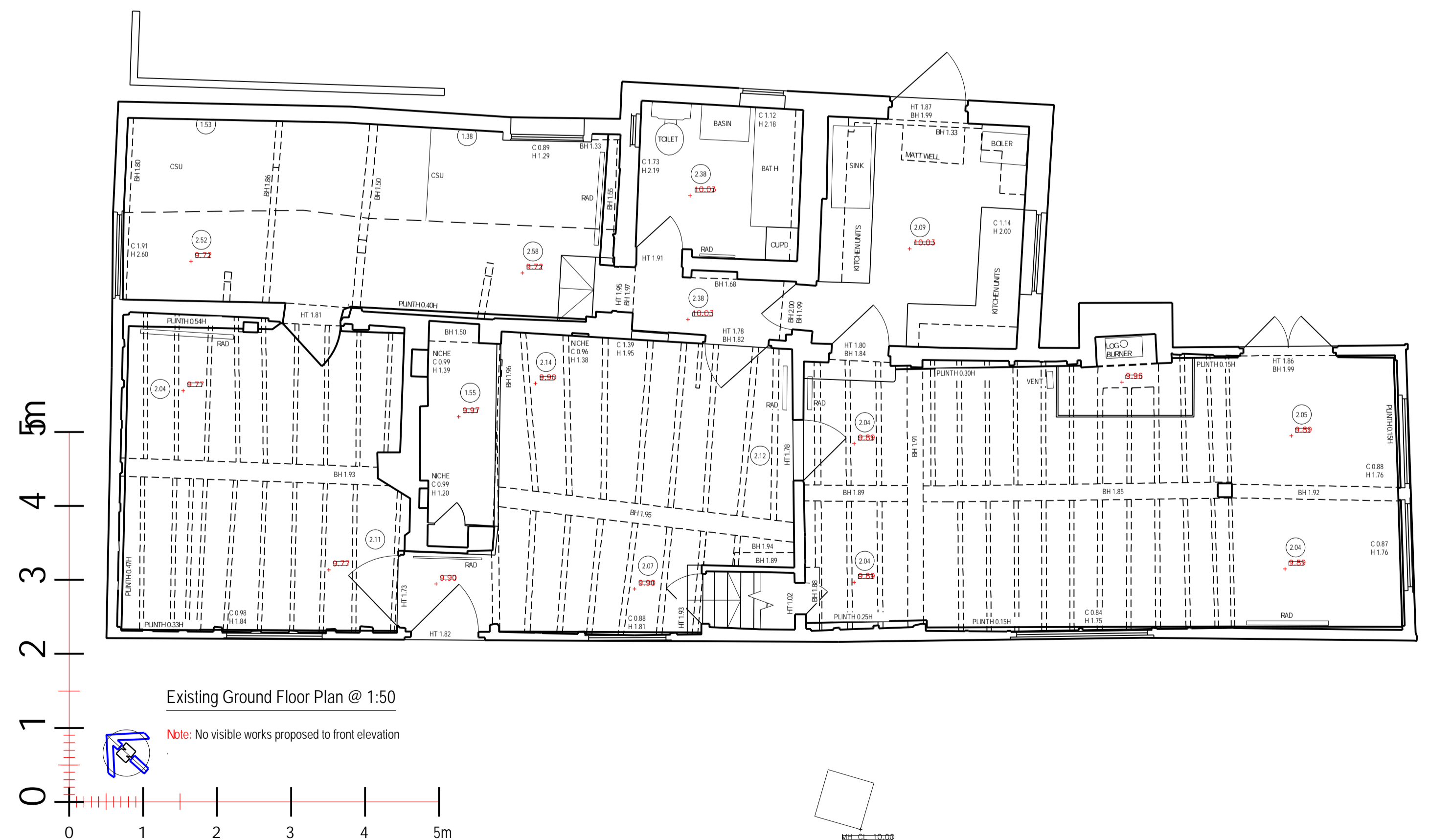
Existing Ground Floor Plan @ 1:50

Note: No visible works proposed to front elevation