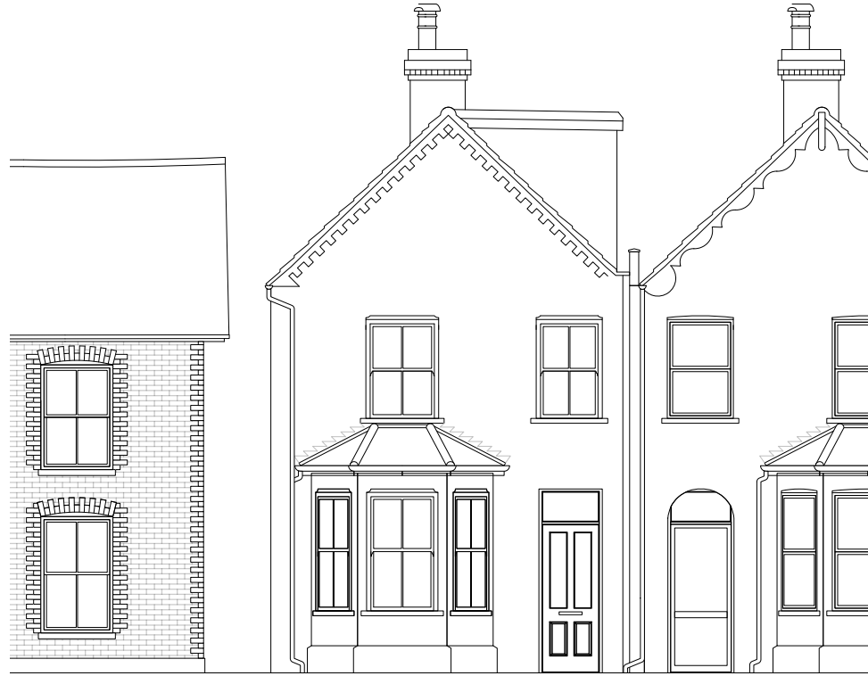
Front elevation - Existing Scale 1:100