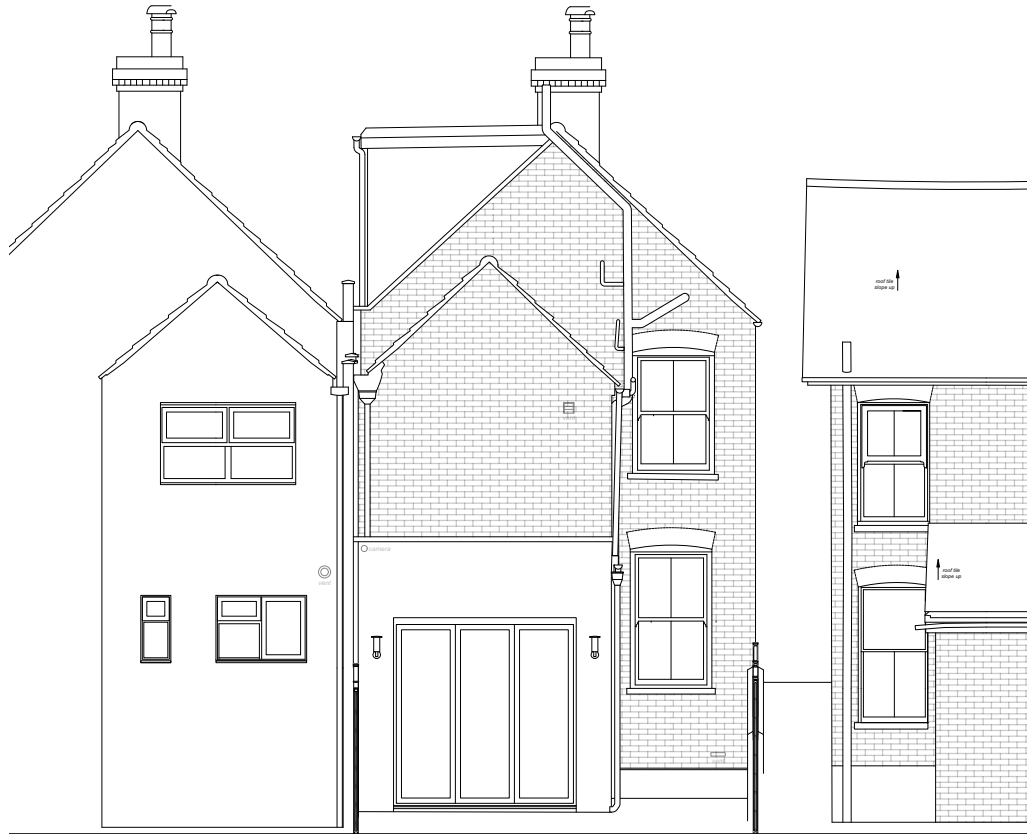
Rear elevation - Existing Scale 1:100