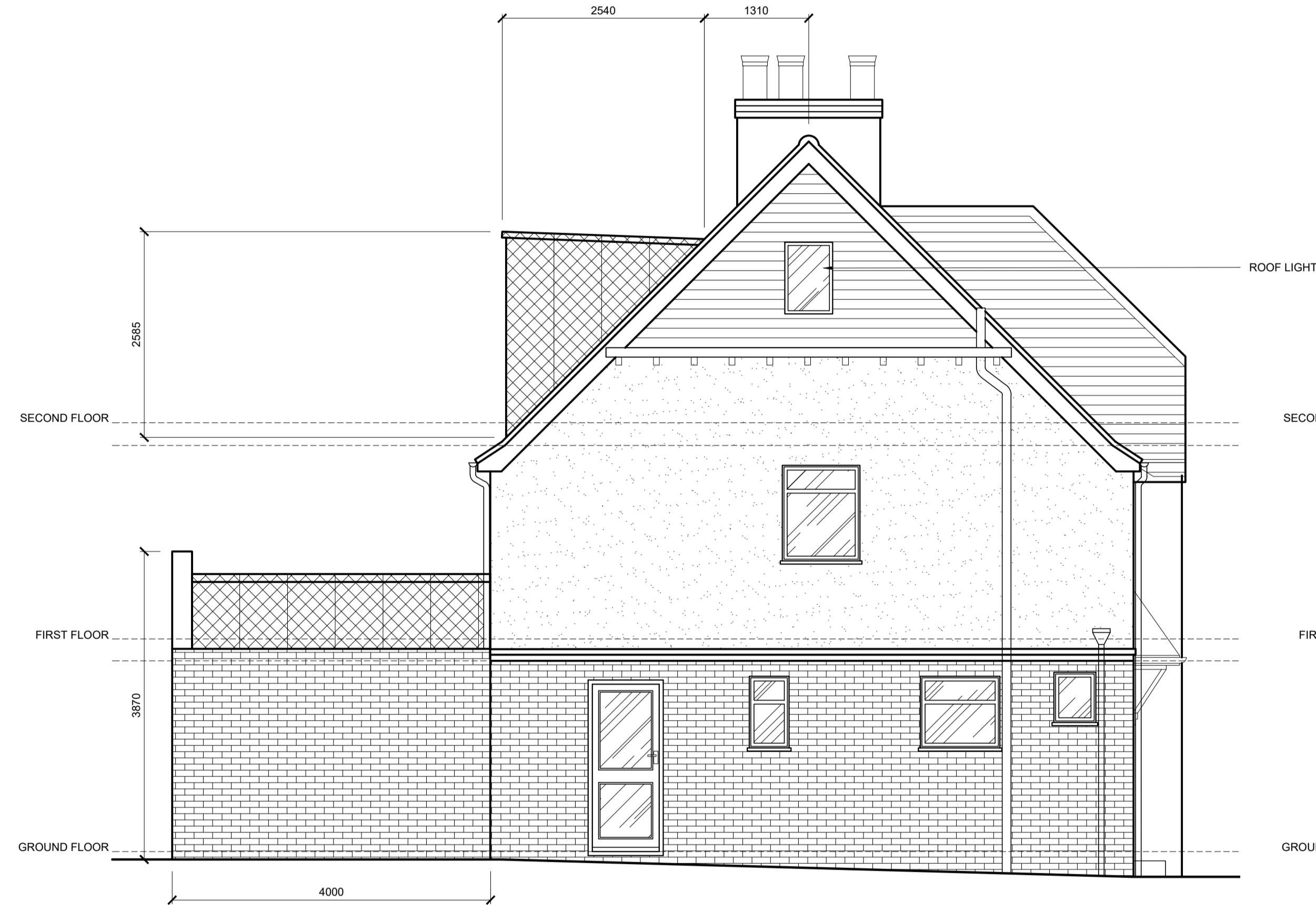
02 PROPOSED SIDE ELEVATION SCALE 1:50