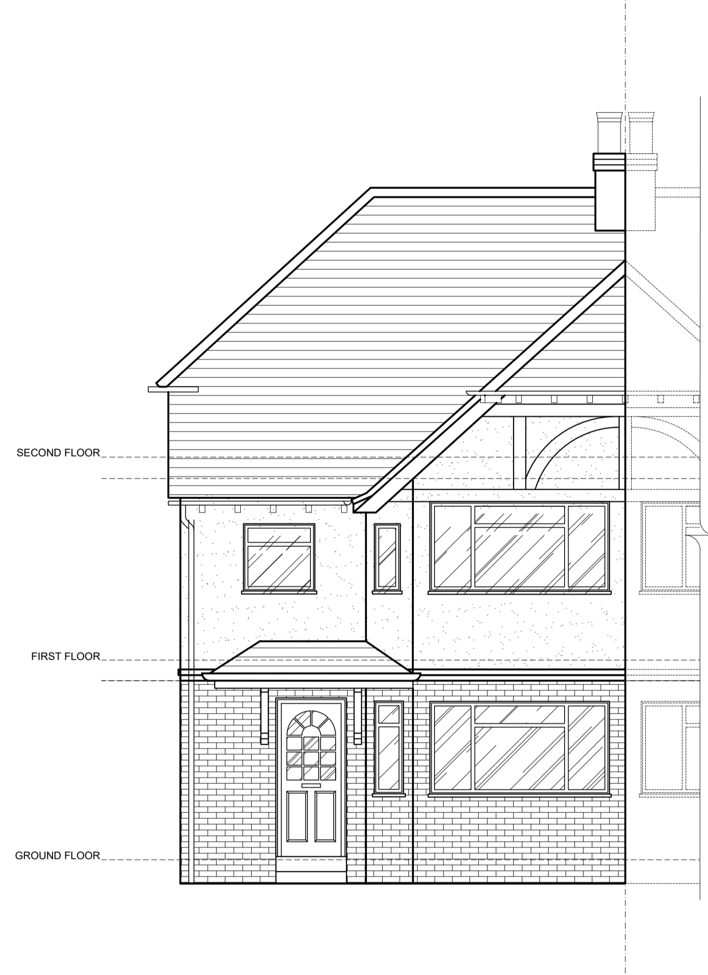
01 PROPOSED FRONT ELEVATION SCALE 1:50