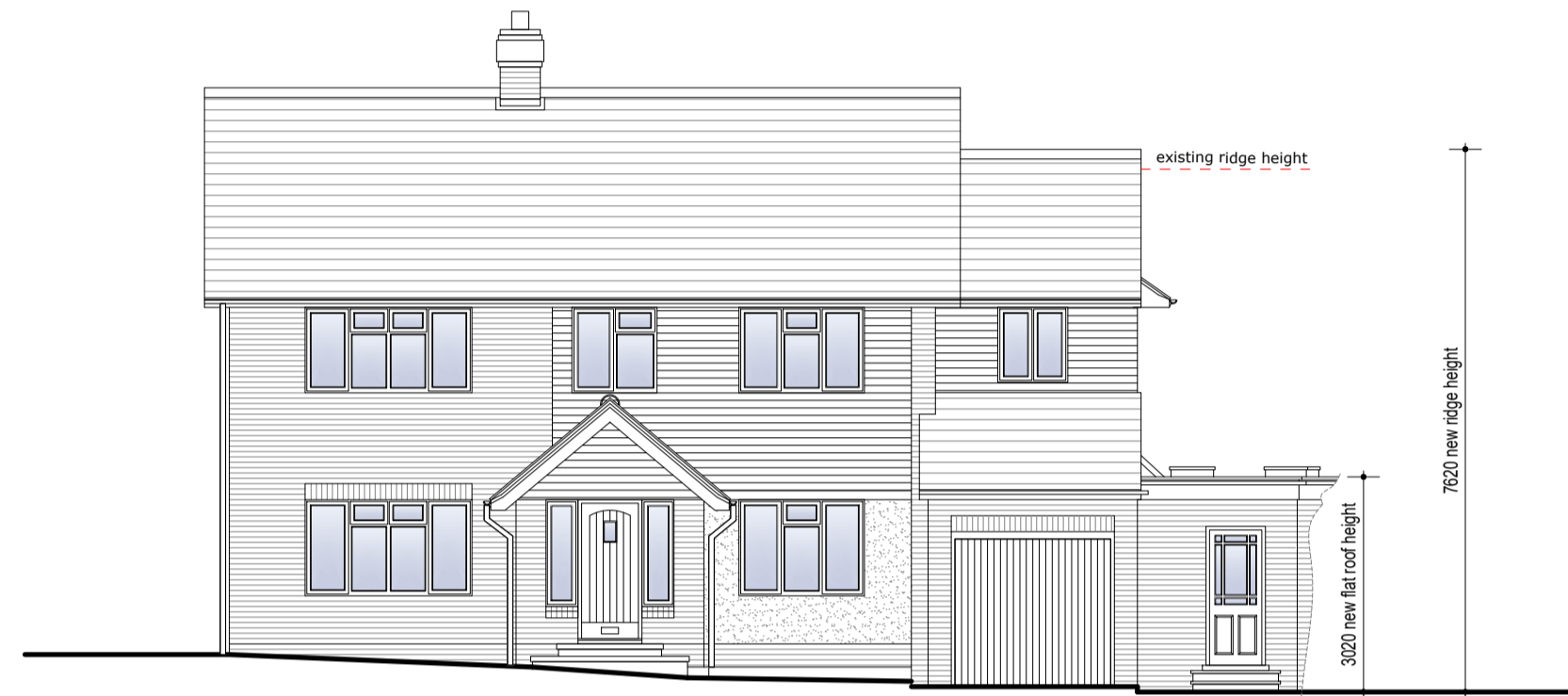
Front Elevation (South Facing)

Do not scale from this drawing. Dimensions given are for illustrative purposes only. All dimensions shown are to the nearest 25mm.