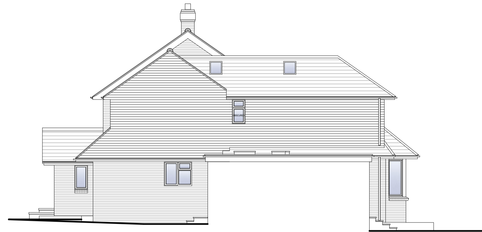
Side Elevation (East Facing)