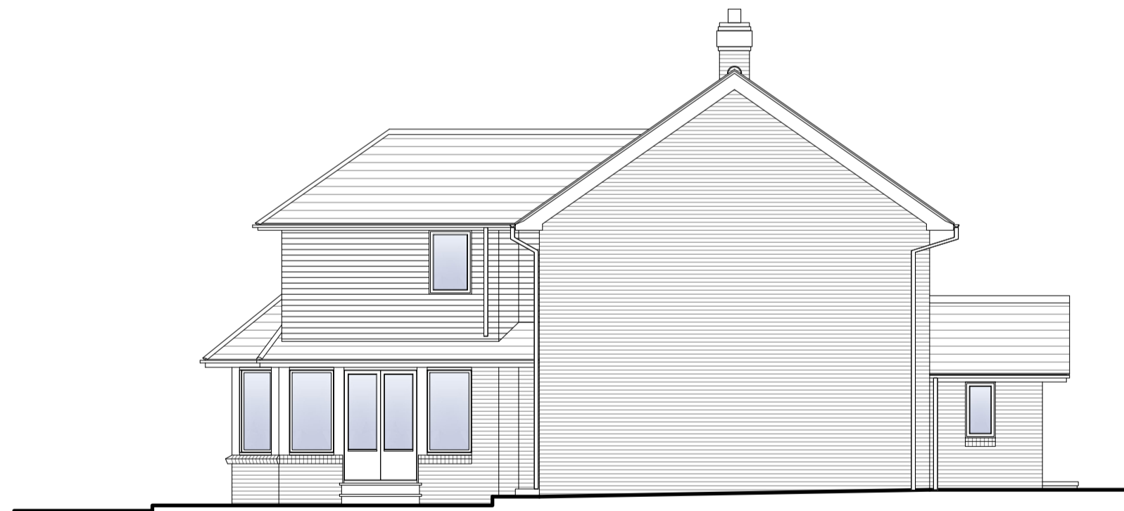
Side Elevation (West Facing)