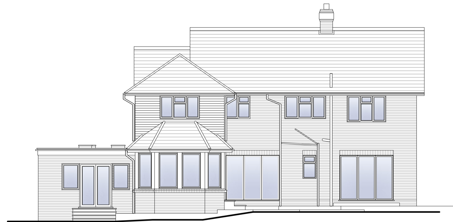
Rear Elevation (North Facing)