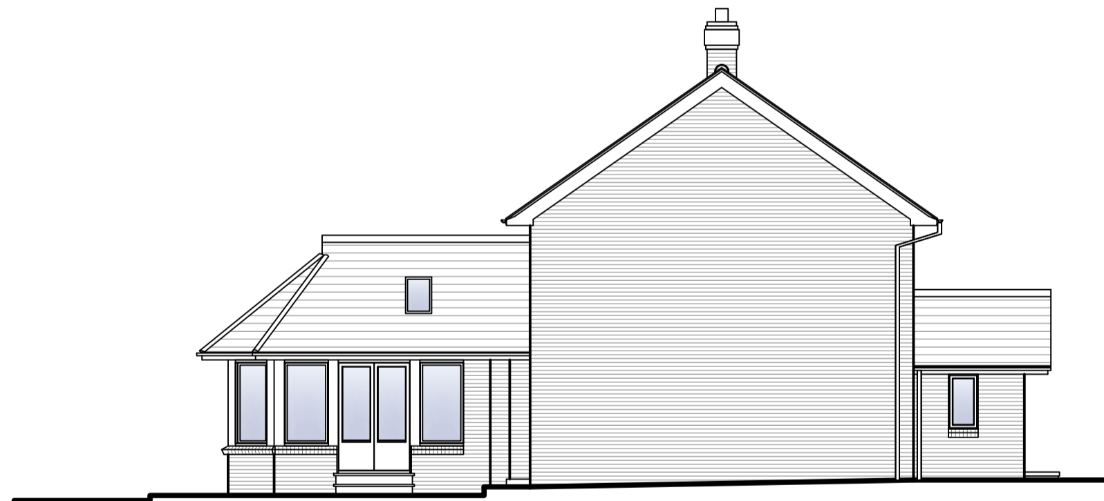
Side Elevation (West Facing)