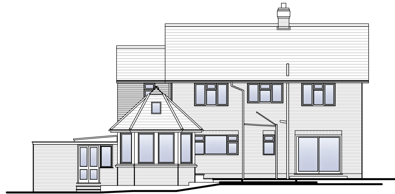
Rear Elevation (North Facing)