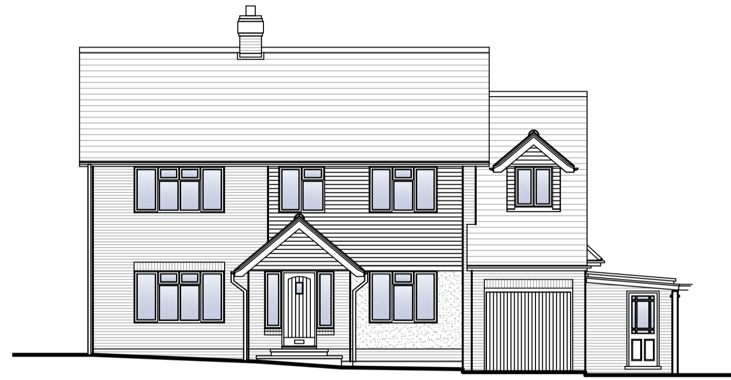
Front Elevation (South Facing)

Do not scale from this drawing. Dimensions given are for illustrative purposes only. All dimensions shown are to the nearest 25mm.