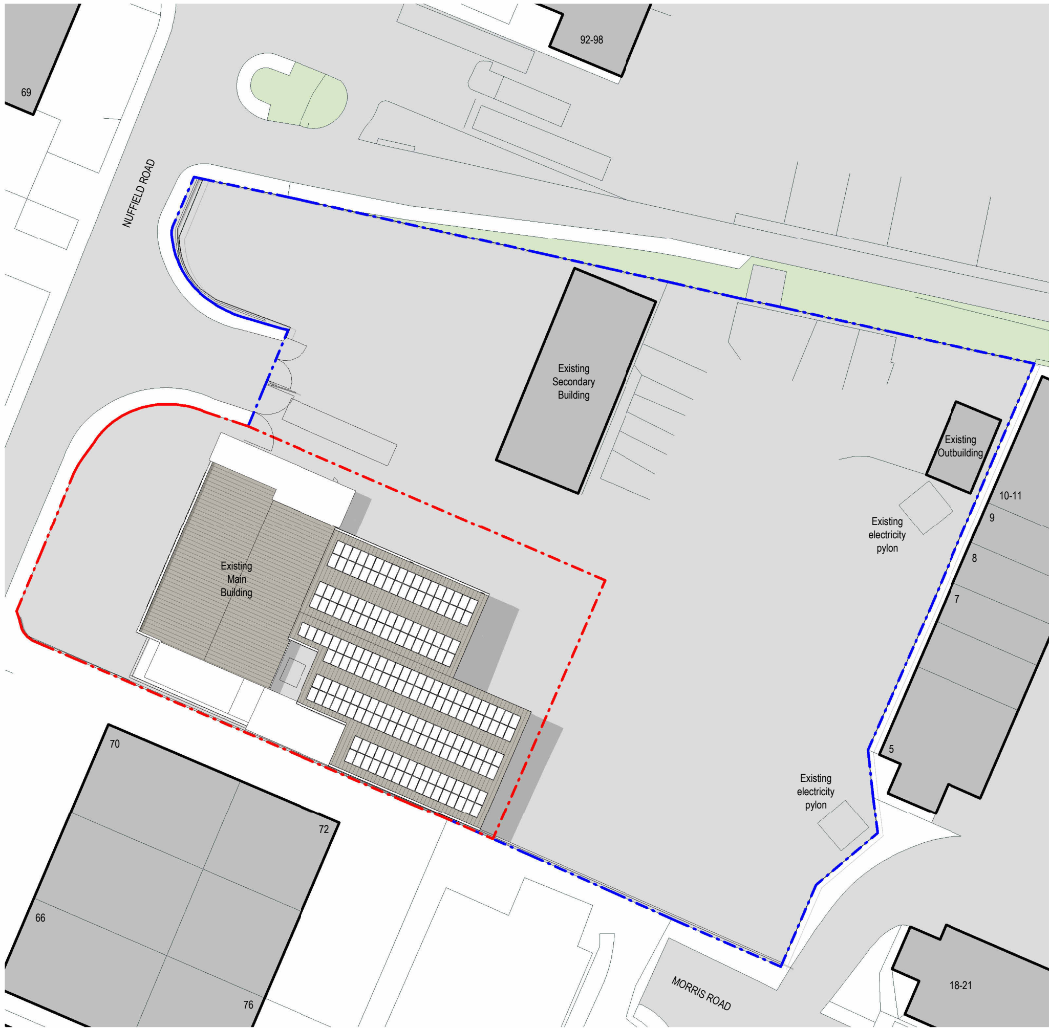
Block Plan 1 : 500