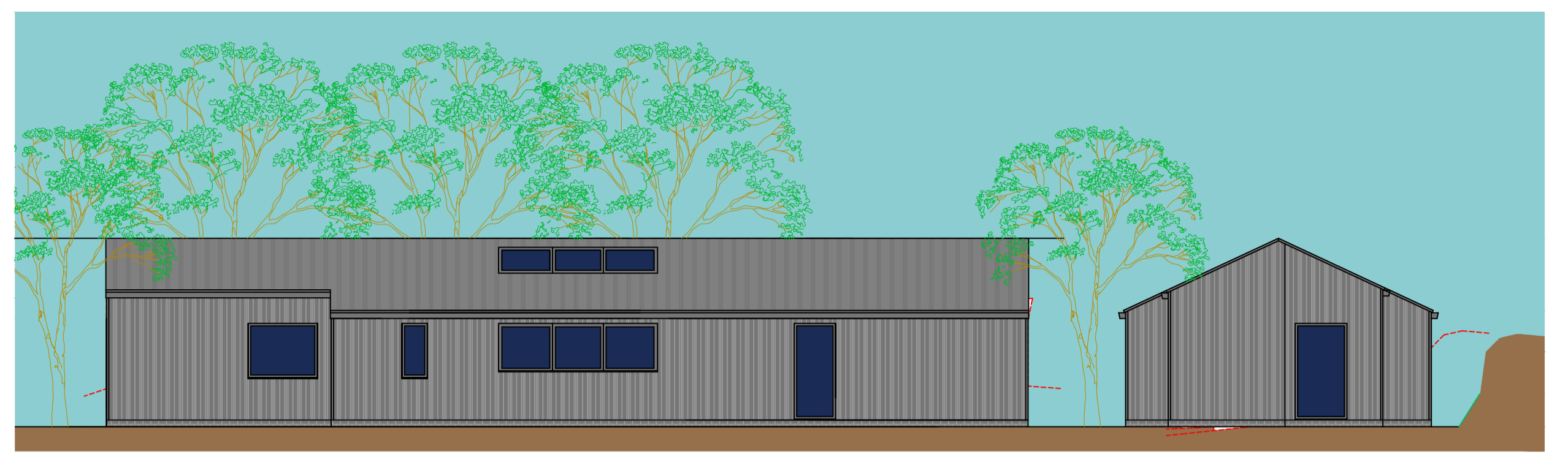
WEST ELEVATION NORTH ELEVATION