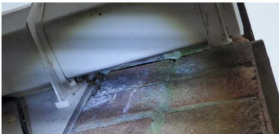
7 Gap above brick work (now temporarily blocked with a rag)