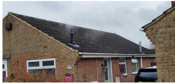
4 Side – west aspect