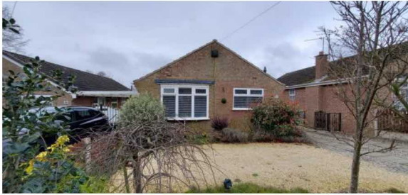
1 Front – north aspect