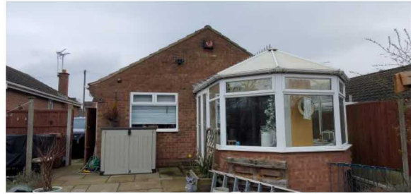
2 Rear – south aspect