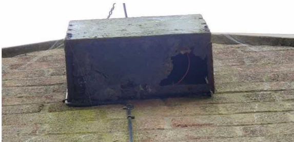
5 Hole in metal comms box