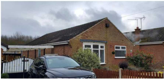
3 Side – east aspect