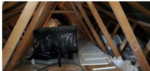
8 Internal view of the loft