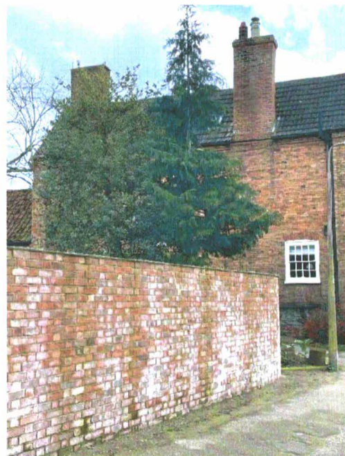
Further views of the two intertwined trees in SW corner of garden