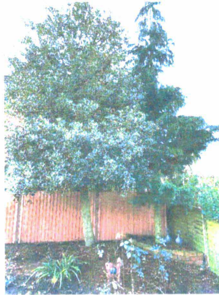
Image showing the SW corner of the garden to The White House showing the two trees closest to the boundary.

Leylandii – Located at 1.5m from the proposed new brick wall with: