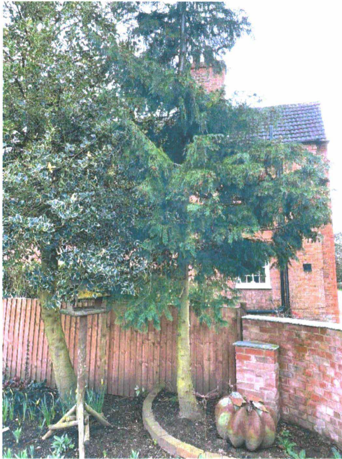
^ Variagated Holly 6.5m height Retain