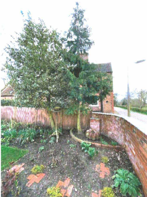
^ Leylandii 7.5m height Remove