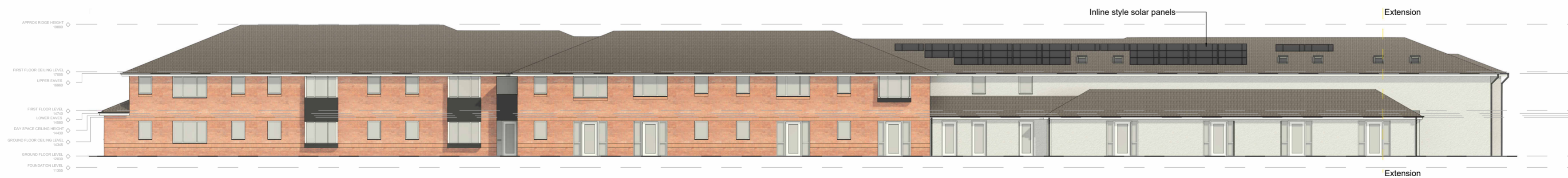
Proposed South East Elevation 1 : 200