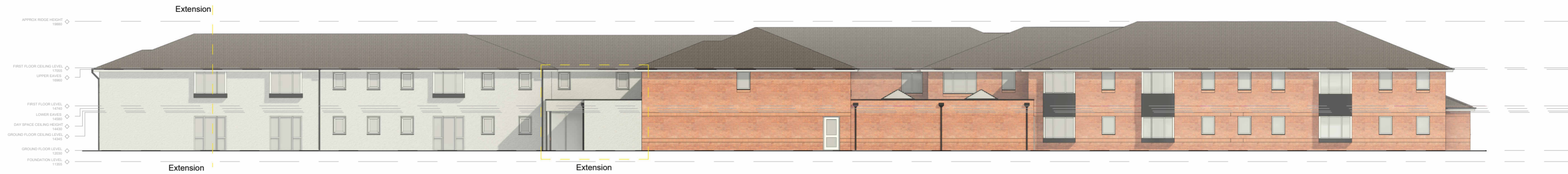
Proposed North West Elevation 1 : 200