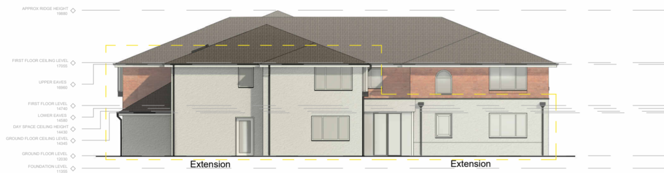
Proposed North East Elevation 1 : 200