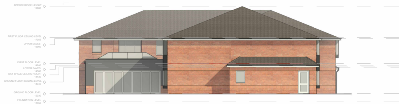
Proposed South West Elevation 1 : 200