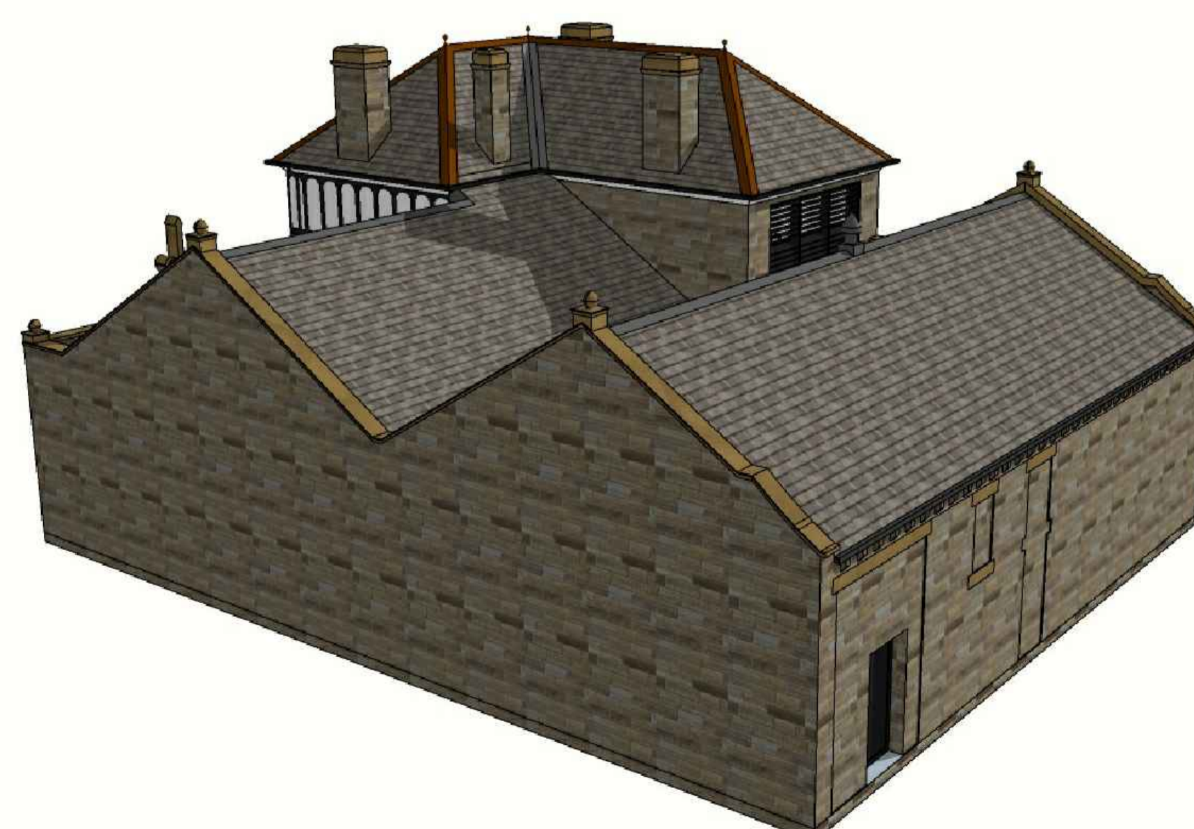
Rear Perspective View Scale nts