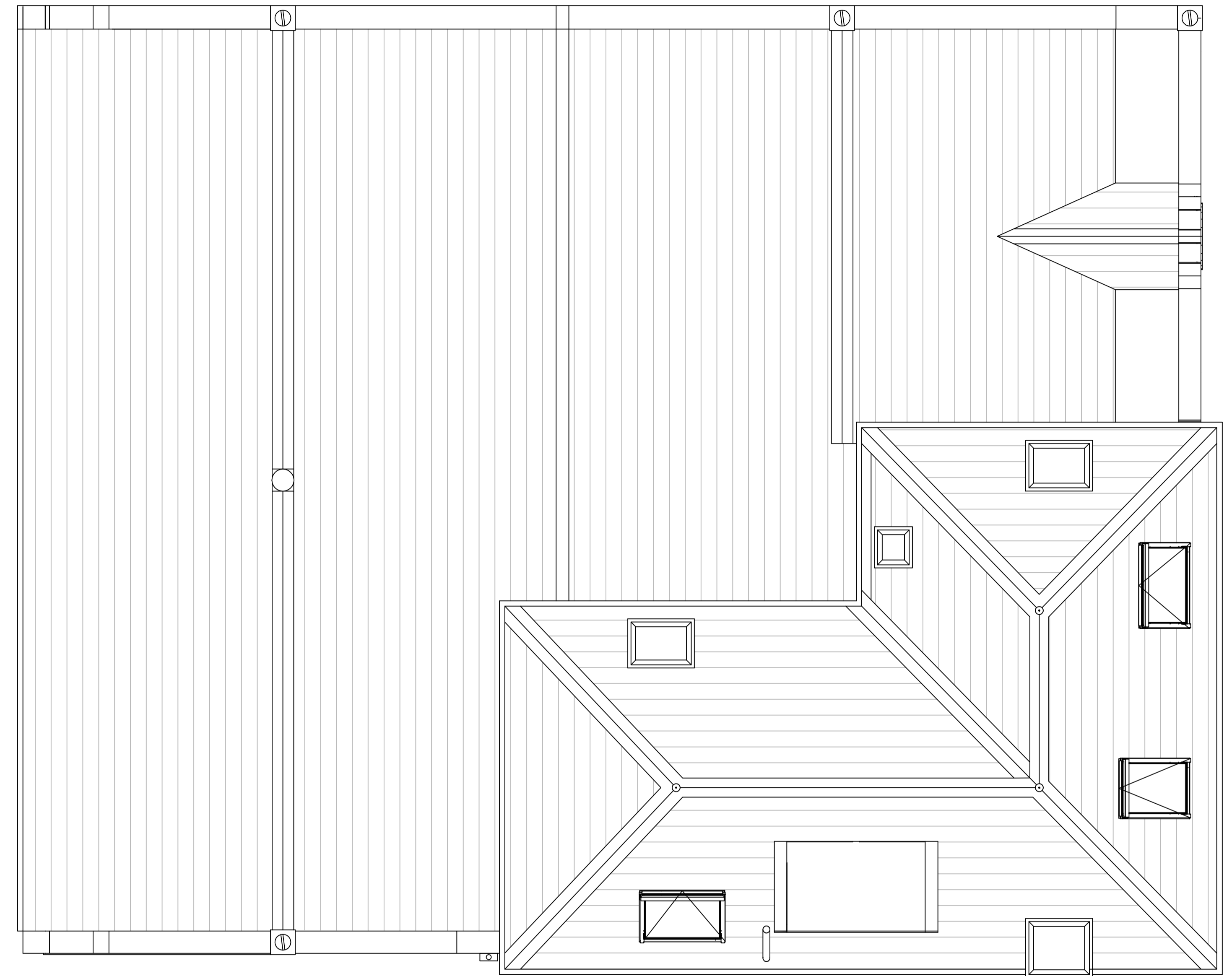
Roof Plan Scale 1:100