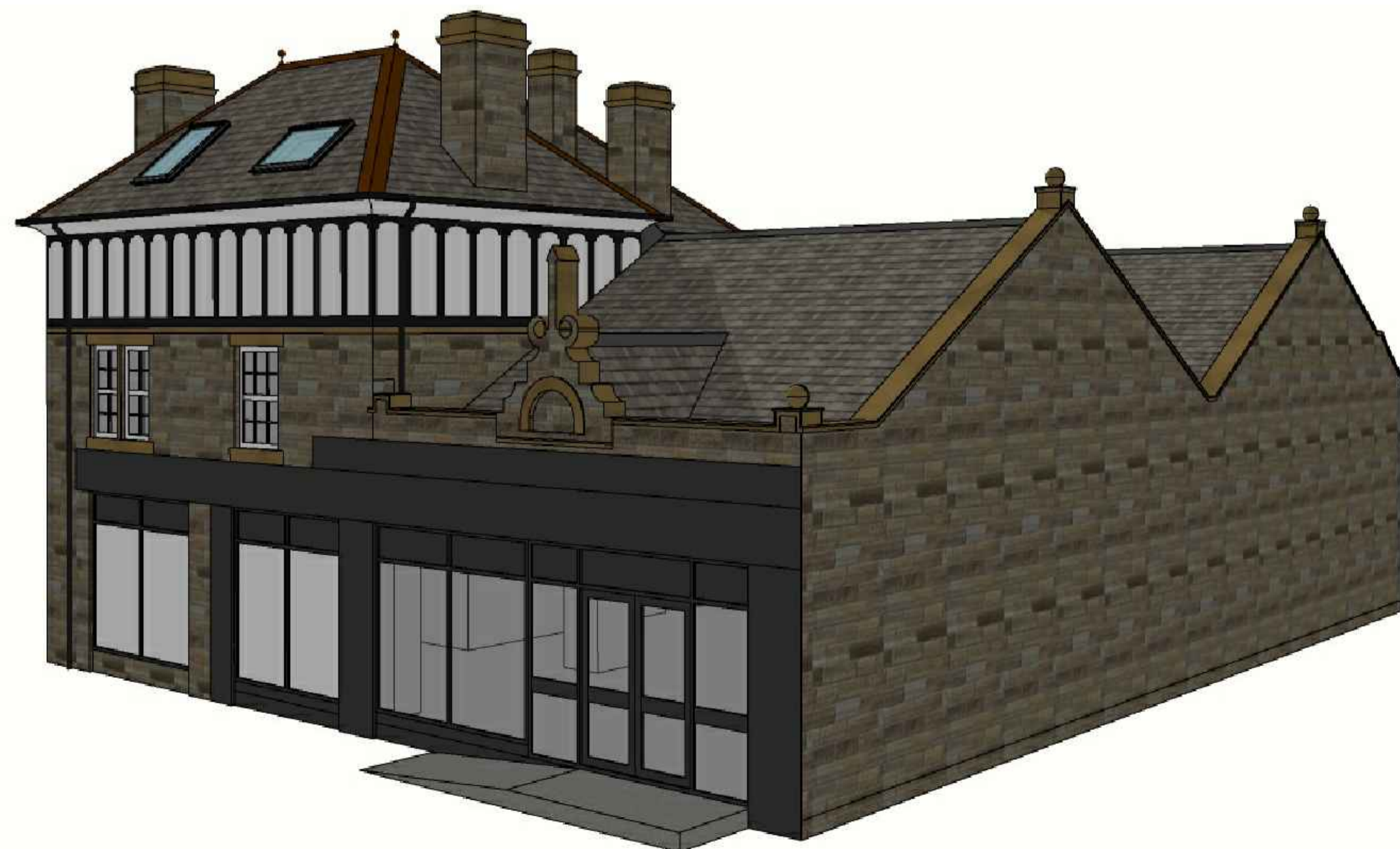
Front Perspective View Scale nts