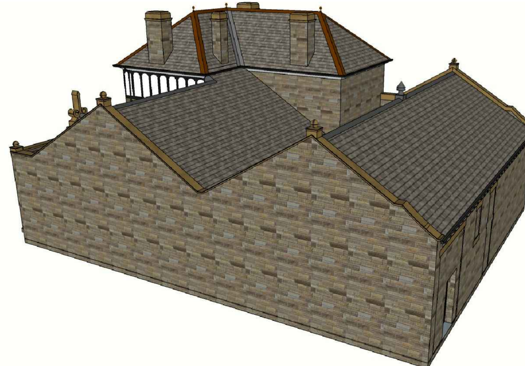
Rear Perspective View Scale nts