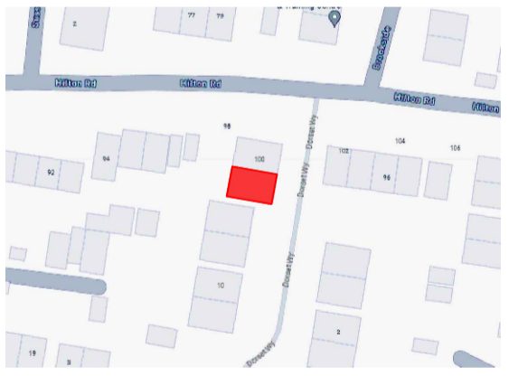
SITE PLAN 4 DORSET WAY, CANVEY ISLAND, SS8 9XF