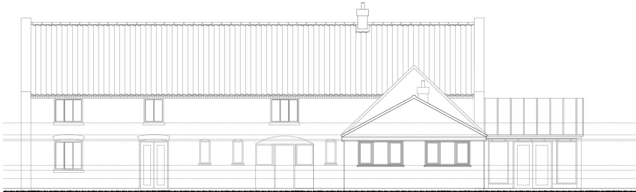
A EXISTING NORTH 005 ELEVATION - SCALE 1:100