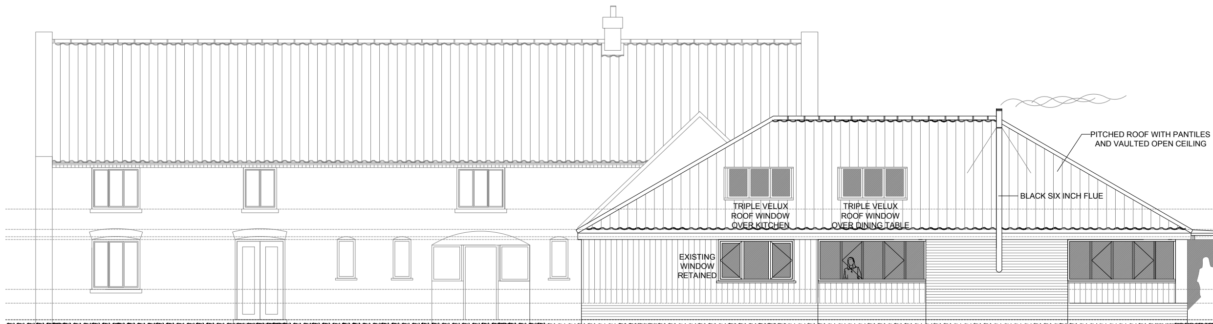
B PROPOSED NORTH 005 ELEVATION - SCALE 1:100