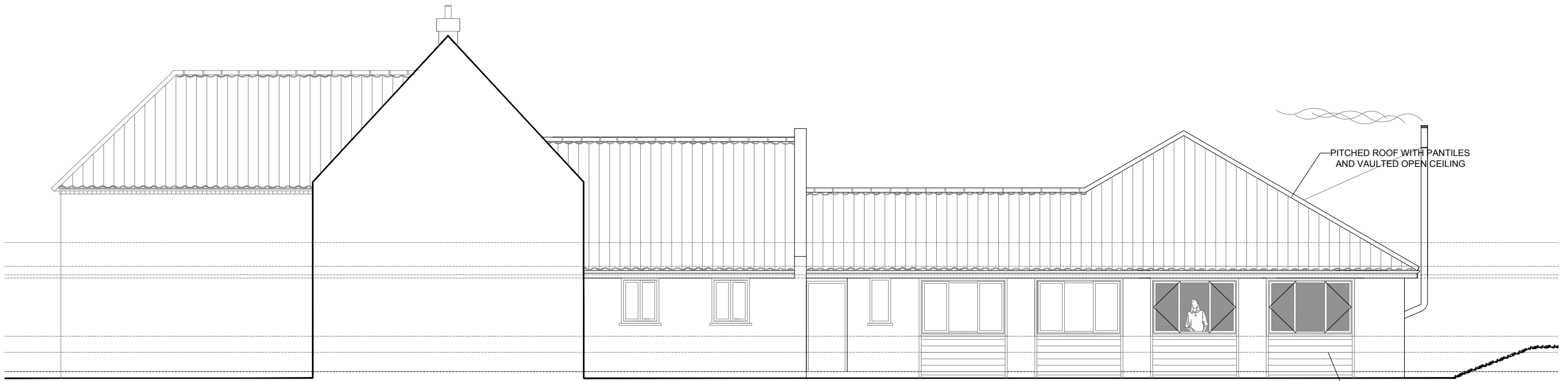
B EXISTING EAST ELEVATION / PARTIAL BUILDING 007 SECTION THROUGH COURTYARD - SCALE 1:100

PITCHED ROOF WITH PANTILES AND VAULTED OPEN CEILING