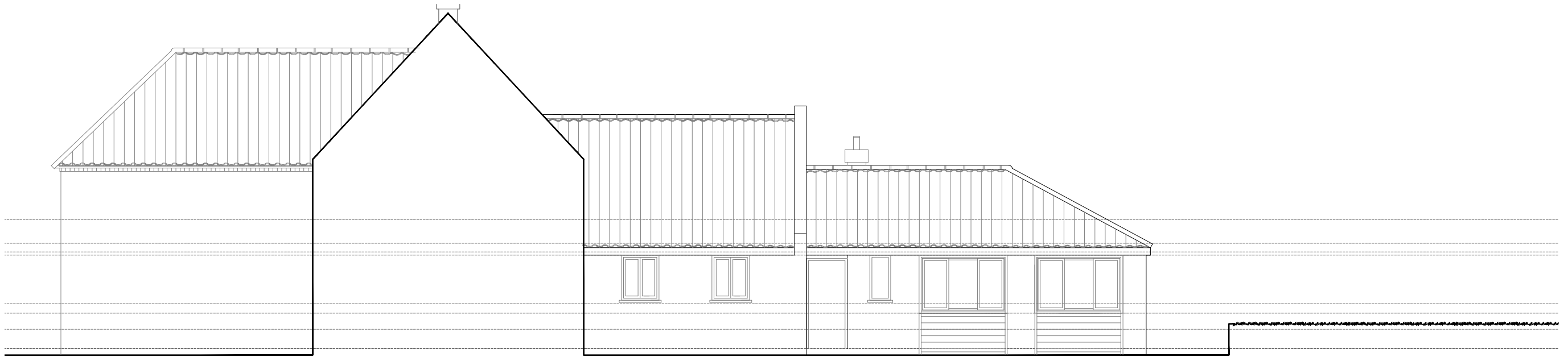
A EXISTING EAST ELEVATION / PARTIAL BUILDING 007 SECTION THROUGH COURTYARD - SCALE 1:100