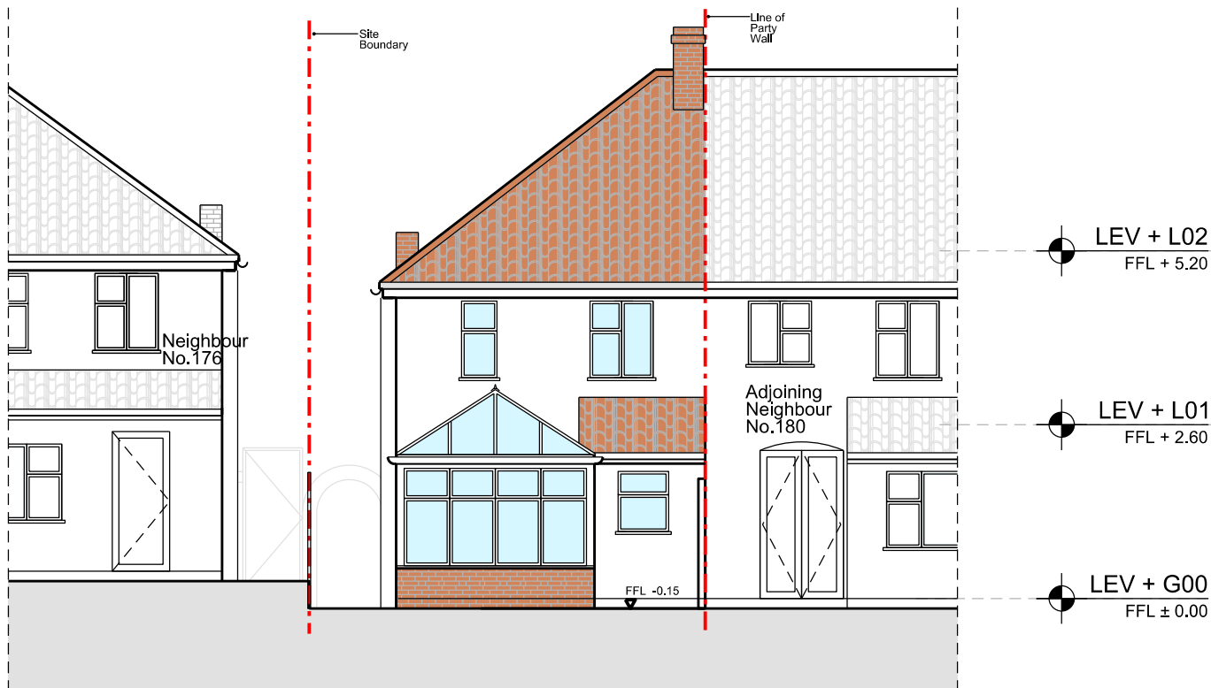
07 REAR ELEVATION 1:100