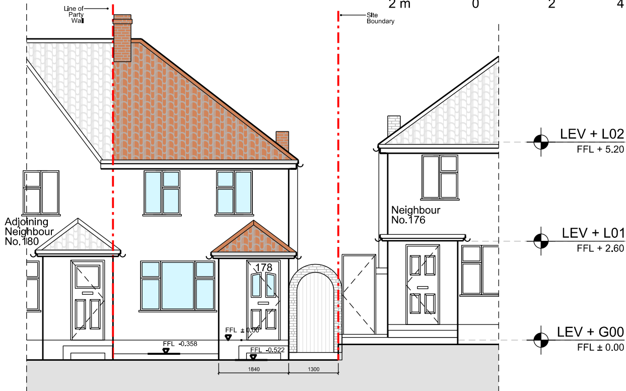
06 FRONT ELEVATION 1:100